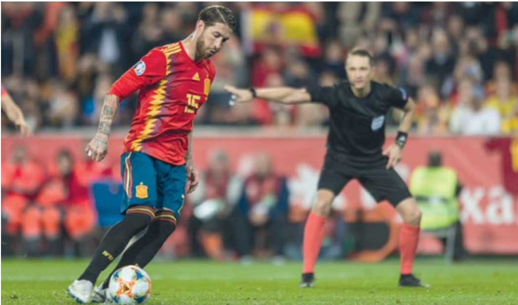
Sergio Ramos chips the ball past Norway's goalkeeper from the penalty spot

Coach Luis Enrique named an attacking line-up, with Marco Asensio, Alvaro Morata and