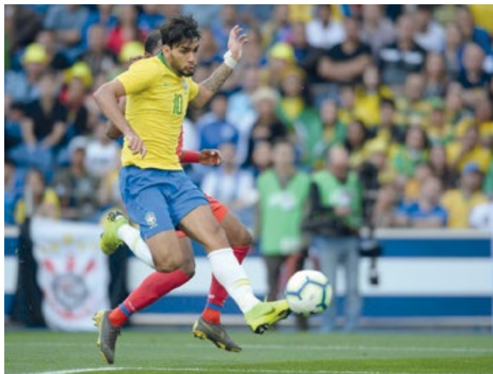
Brazil's Lucas Paqueta shoots to score

Brazil's Lucas Paqueta scored his first international goal against Panama