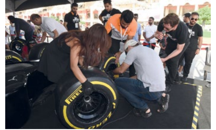
Race-goers engage in activities at BIC's F1 Fanzone