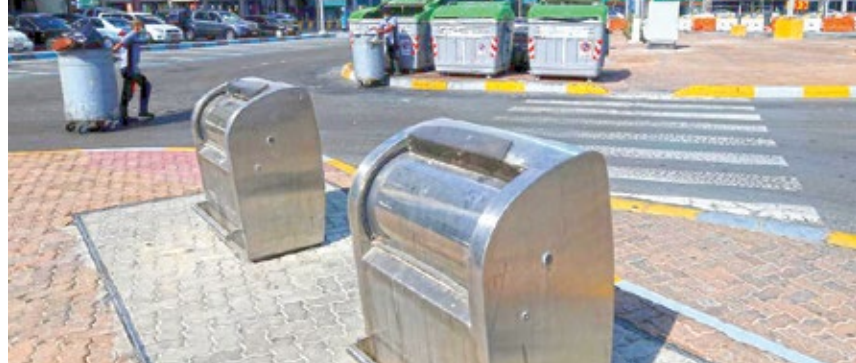
The installation of underground trash bins were not a great success in the UAE.

"Underground rubbish bins installed sore," residents say. for what is believed to have been millions