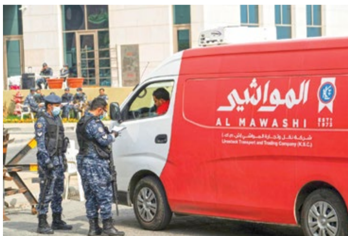
Kuwaiti special forces wearing protective masks guard the entrance to a hotel, where people evacuated from Iran are being held in quarantine, in Fahaheel, Kuwait.