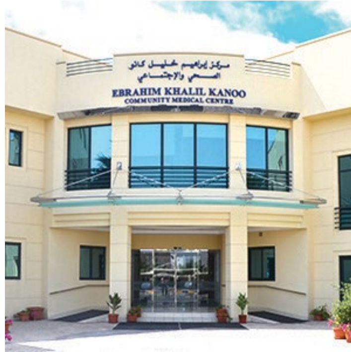
Ebrahim Khalil Kanoo Community Medical Centre has been designated as an isolation centre.

measures to protect themselves from coronavirus. The ministry sources said that educational campaigns are in full