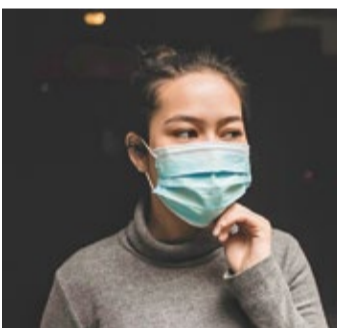
There is a huge demand for face masks across the Kingdom.

"Though no cases are reported in the Kingdom, people here are taking special caution and a good number of them are wear-