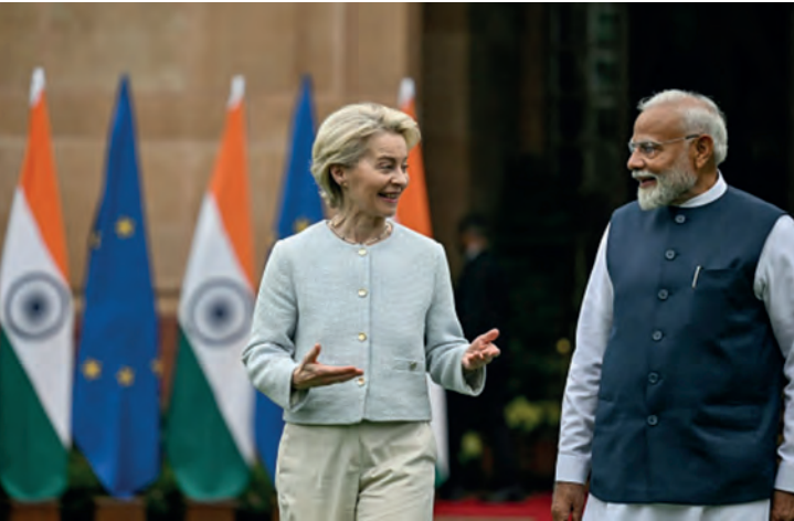
European Commission President Ursula von der Leyen (L) speaks with India's Prime Minister Narendra Modi in New Delhi (file photo)

Central to the discussions is the push to finalize a long-pending Free Trade Agreement. Kallas noted that the deal would be cru-