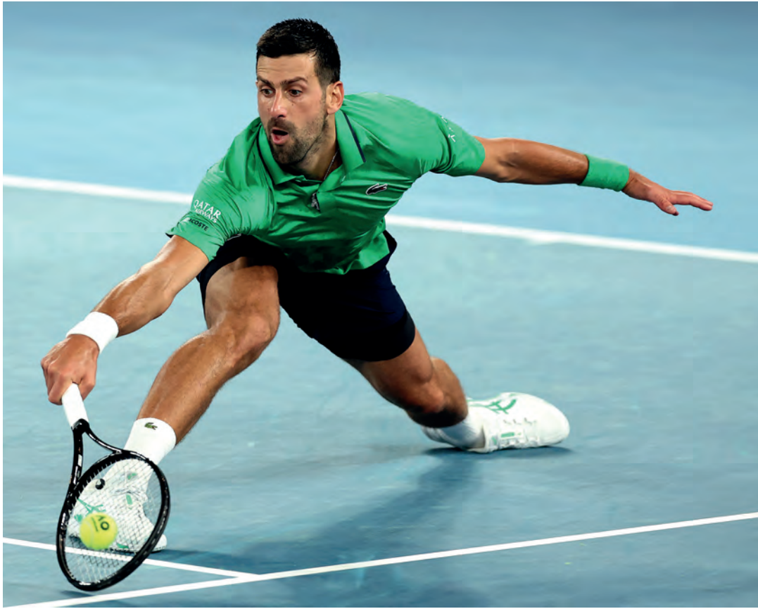
Serbia's Novak Djokovic hits a return to Netherlands' Botic van de Zandschulp

Dutchman Botic van de Zandschulp 6-3, 6-4, 7-6 (7/4) on Rod Laver Arena.