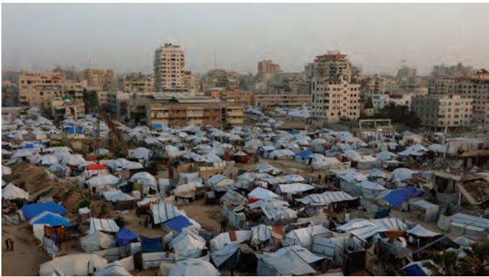
Tents housing displaced Palestinians are erected on empty land near buildings destroyed by the Israeli military, in Gaza City.

Of the 251 people seized during Hamas's October 7, 2023 at-