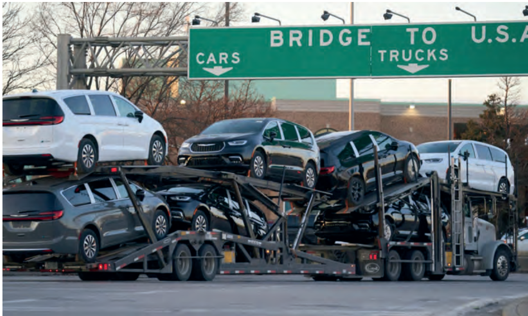
A truck carrying vehicles prepares to cross into the US from Canada

US President Donald Trump yesterday warned Canada that if it concludes a trade deal with China, he will impose a 100 percent tariff on all goods coming over the border. Relations between the United States and its northern neighbor have been rocky since Trump returned to the White House a year ago, with spats over trade and Canadian Prime Minister Mark Carney decrying a “rupture” in the US-led global order. During a visit to Beijing last week, Carney hailed a “new strategic partnership” with China that resulted in a “preliminary but landmark trade agreement” to reduce tariffs -- but Trump warned of serious consequences should that deal be realized. If Carney “thinks he is going to make Canada a ‘Drop Off Port’ for China to send goods and products into the United States, he is sorely mistaken,” Trump wrote on his Truth Social platform. “China will eat Canada alive, completely devour it, including the destruction of their busi-