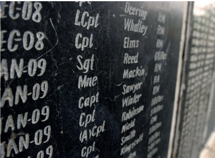
a wall bearing the names of British military personnel who have died in Afghanistan since 2001 at the British Cemetery in Kabul

“It is unacceptable that the American president questions the commitment of allied sol-