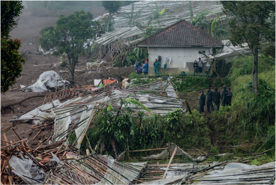
Destroyed greenhouses remain after a landslide struck in Pasirlangu village, Bandung, West Java

She said her house survived the landslide, but her niece, her niece's husband and their two children were missing.