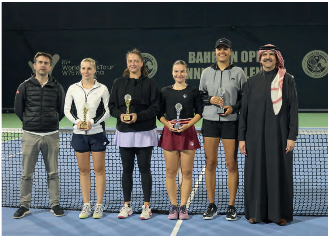
Winners with their trophies