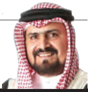
CAPTAIN MAHMOOD AL MAHMOOD

I followed the Public Prosecution's release of its 2025 annual statistics with close interest. Beyond the numbers, the data offers a clear picture of how crime is evolving — and how the justice system continues to respond in order to protect society and uphold the rule of law.