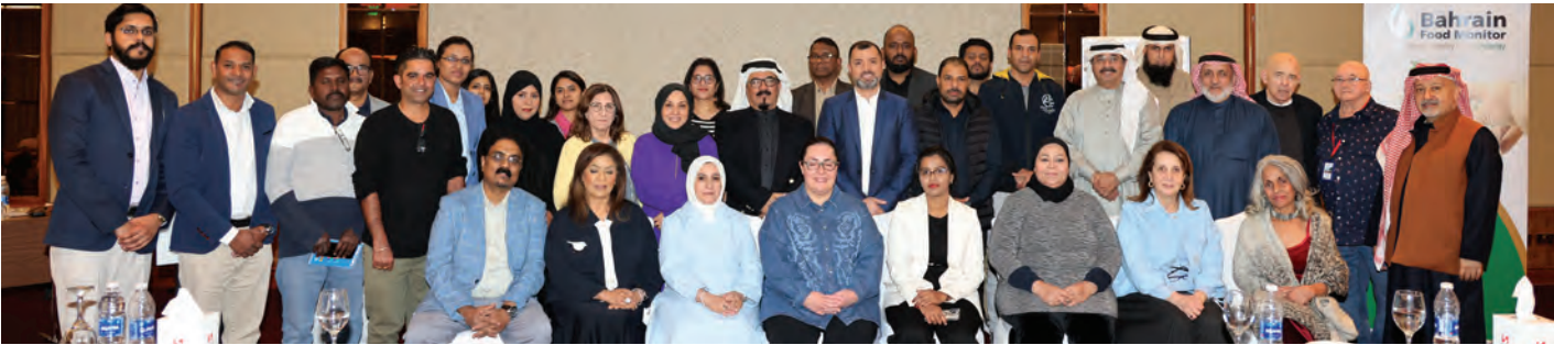
Participants at the seminar

Advanced methods support sustainable expansion of Bahrain’s date palm sector