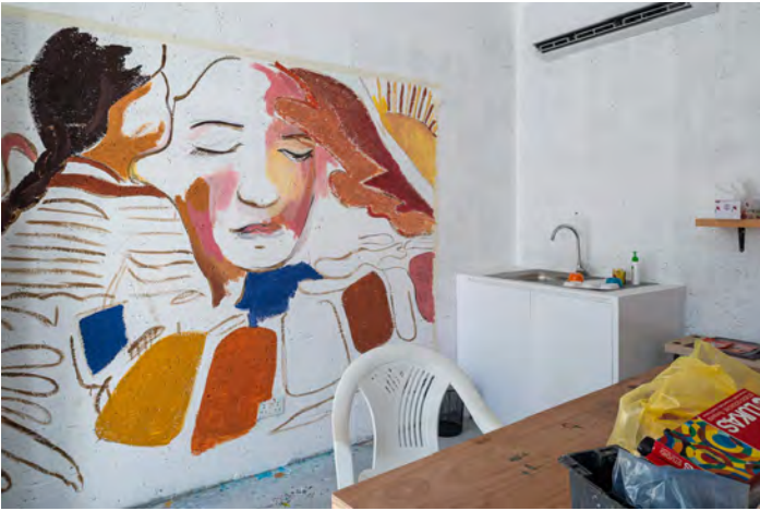
Al Riwaq Art Space expands into a non-profit campus for art and design

Origins From its early years, Al Riwaq played a quiet but influential role in supporting contemporary and conceptual practices in Bahrain. Its programmes moved beyond exhibitions to include lectures, residencies and educational initiatives, contributing to the transformation of the Block 338 neighbourhood in Adliya. That phase marked a turning point where art became embedded in everyday urban life rather than confined to gallery walls. Shift Today, Al Riwaq operates from its current location in the Qufool area, within a historic residence that once hosted private social gatherings. The building has been reim-