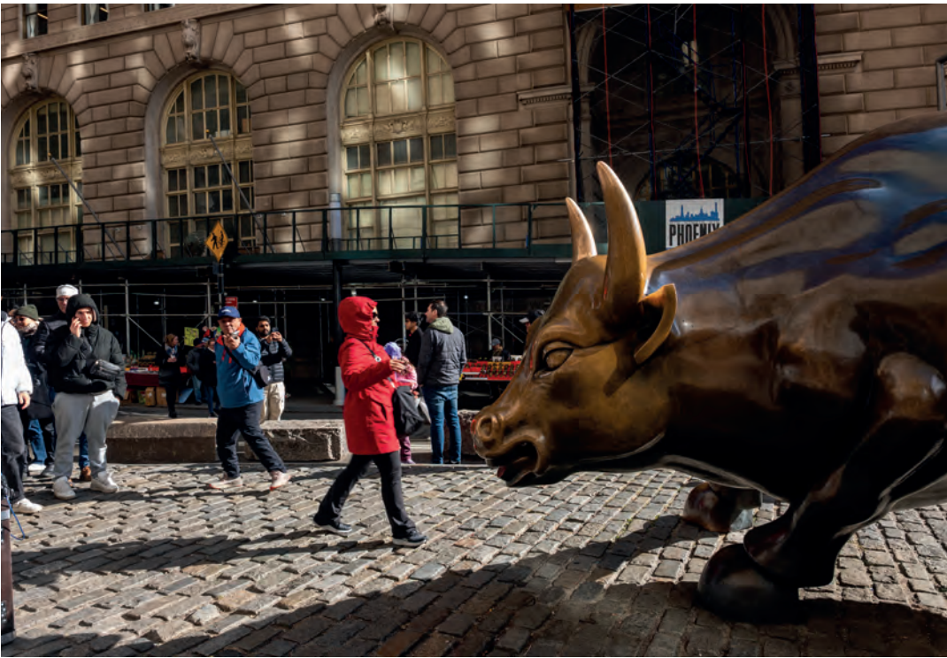
The Wall Street bull stands in the financial district near the New York Stock Exchange (NYSE)

The closing and opening bells of the New York Stock Exchange (NYSE) may become a ringing ritual of yesteryear, as the market moves toward non-stop trading. This week, the Intercontinental Exchange announced it is developing a platform for 24/7 operations that offers “instant settlement.” The around-the-clock operations would rely on digital tokens mirroring the shares of listed companies, the NYSE’s parent company said in a statement. NASDAQ, another New York-based trading exchange, could follow suit as early as this year. The move is pending approval by federal regulators at the US Securities and Exchange Commission (SEC), and would amount to a minor revolution for the way money moves in US stock markets. ‘Waste of time’ In the early days of the exchange, investors had to be