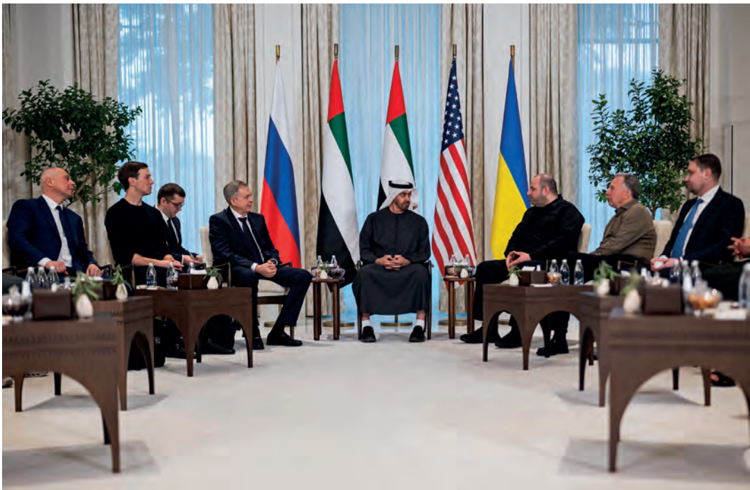
UAE President Sheikh Mohamed bin Zayed al-Nahyan (C) speaking with the heads of delegations participating in the UAE-hosted trilateral talks between the US, Russia and Ukraine, at the Al Shati Palace in Abu Dhabi

“They’ll just say that everything is fine, that again, nothing has been agreed, and again there will be rockets,” said