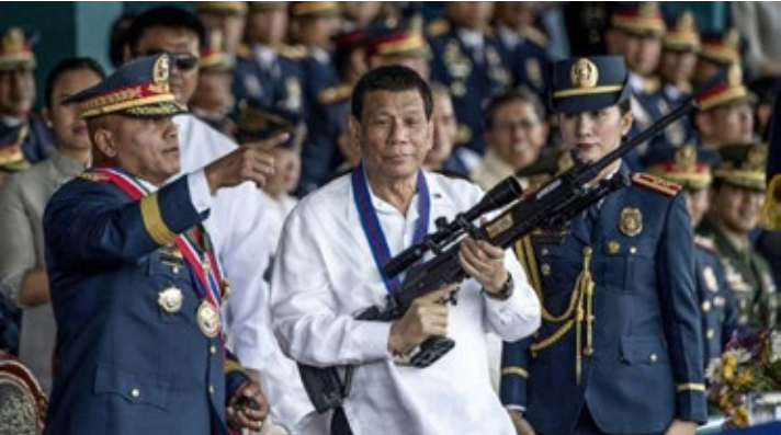
Philippine President Rodrigo Duterte holds a Galil sniper rifle with outgoing Philippine National Police (PNP) chief Ronald dela Rosa (L)

rection there, one, I will terminate the bases -- Visiting Forces Agreement,” Duterte added.