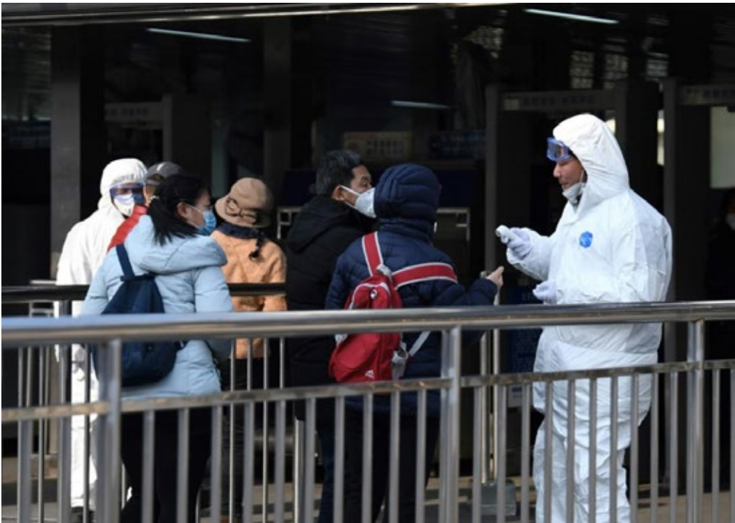
Passengers wearing protective facemasks are checked by security personnel wearing hazardous material suits at the entrance to the underground train station in Beijing

At a temperature-check station, a medical staffer in bodysuit, face mask and goggles took a thermometer from a