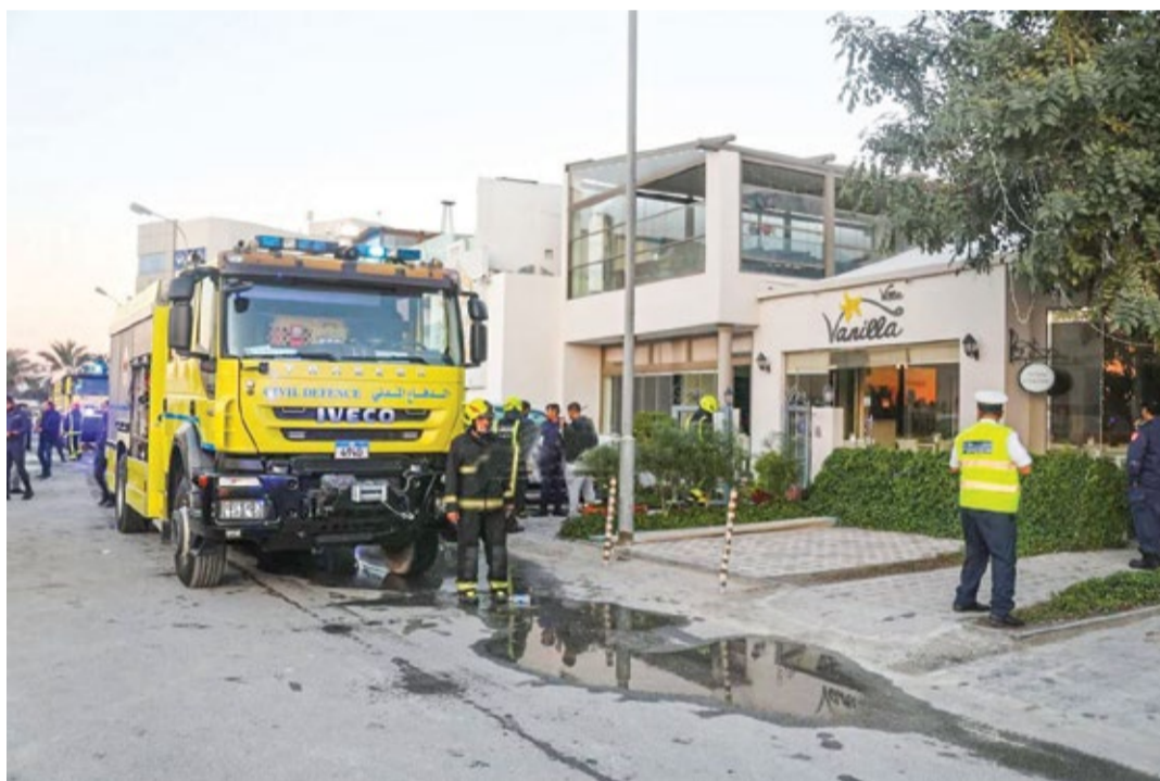
Civil Defence vehicle parked near the coffee shop.

Luckily, there were only a few customers at the time of the incident, according to a source.