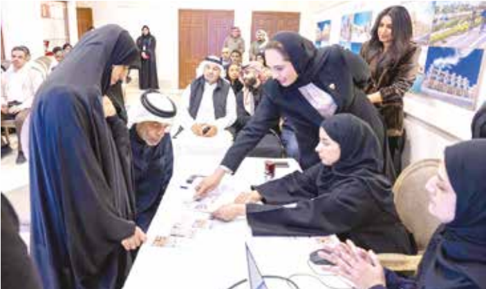
Her Excellency Amna bint Ahmed Al-Rumaihi, Minister of Housing and Urban Planning, supervises the draw procedures

The Ministry of Housing and Urban Planning has announced the start of draw procedures for housing units under Phase Two of the Sitra Housing City project, comprising 531 housing units. It was carried out in implementation of the directives of His Majesty King Hamad bin Isa Al Khalifa to accelerate housing projects to deliver 50,000 new housing units. It was also in accordance with the instructions of His Royal Highness Prince Salman bin Hamad Al Khalifa, the Crown Prince and Prime Minister, to commence the provision of 7,000 housing services.