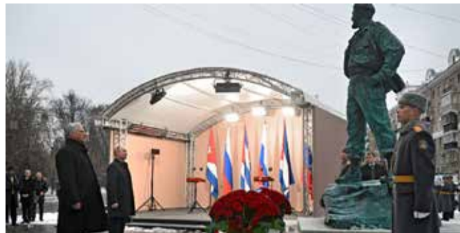
Cuban President Miguel Diaz-Canel and Russian President Vladimir Putin attend an unveiling ceremony of a monument to late Cuban leader Fidel Castro in Moscow, Russia

They shared accounts of alleged sexual violence by Russian armed forces that occurred in various parts of Ukraine: many included allegations of family members being forced to watch or multiple soldiers participating or acts being conducted at gunpoint.