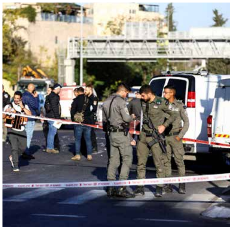
Security and rescue forces work at the scene of an explosion at a bus stop in Jerusalem