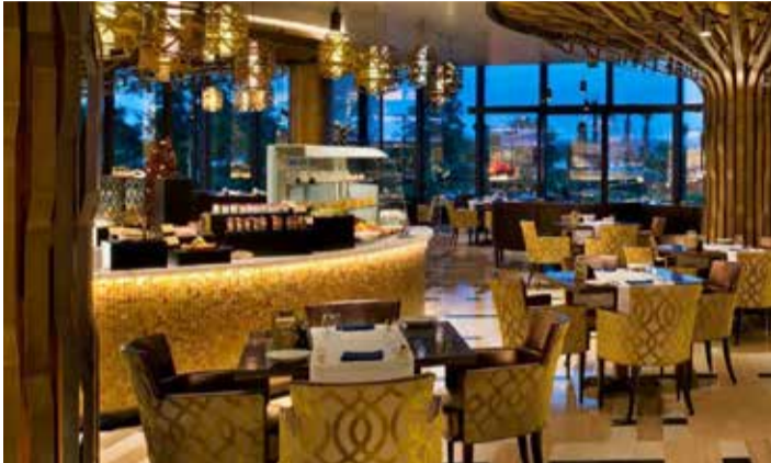
Representative picture

Guidelines also call for encouraging reservation, social