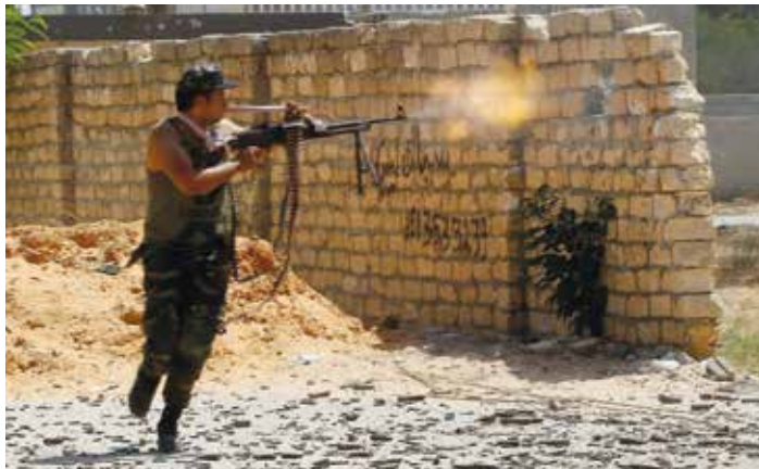
A fighter loyal to the internationally recognised Libyan Government of National Accord trades fire with forces loyal to strongman Khalifa Haftar in the capital Tripoli's suburb of Ain Zara. (File)

The breakthrough was announced yesterday at a signing ceremony that was streamed live on the Facebook page of the UN's