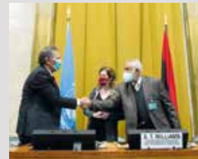
The UN-sponsored talks took place in the format of a 5+5 Joint Military Commission: five delegates from each side attend.

Tripoli is held by the internationally recognised Government of National Accord, while a parliament based in the eastern city of Tobruk is backed by Haftar's forces.