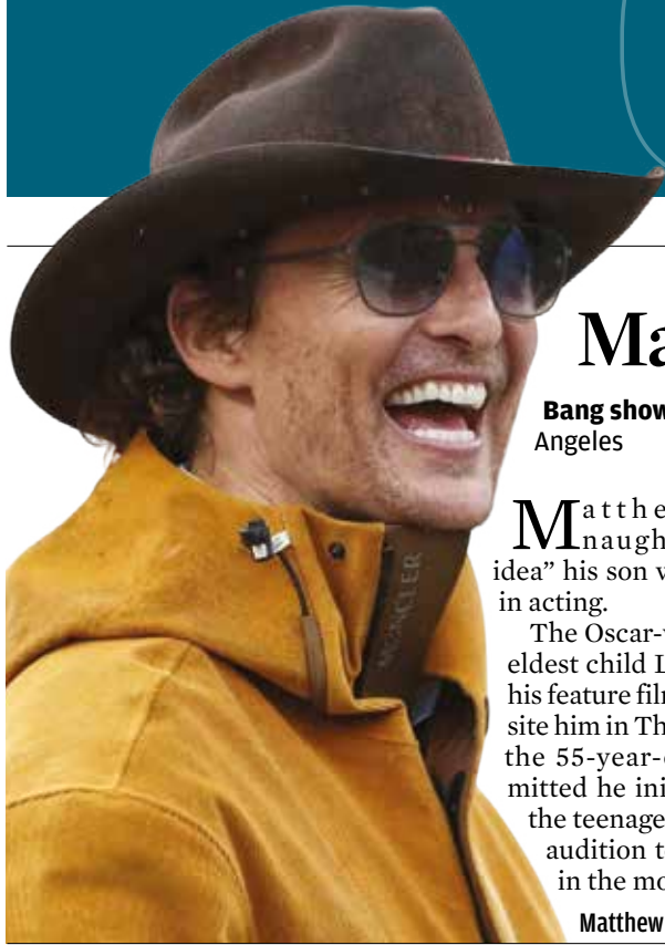
Bang showbiz | Los Angeles