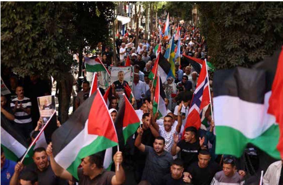
Palestinians chant slogans during a gathering in Ramallah in the Israeli occupied West Bank