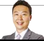
CHEN SHIH-KAI, MINISTER OF TRANSPORTATION AND COMMUNICATIONS ROC (TAIWAN)

The International Civil Aviation Organization (ICAO) convenes its Assembly once every three years. During the event, multilateral meetings and discussions are held to draw up global civil aviation regulations and standards. Nations abide by the conclusions drawn at the Assembly, ensuring the safe and orderly growth of international civil aviation worldwide. The 42nd session of the ICAO Assembly will be held from September 23 to October 3 in Montreal, Canada.