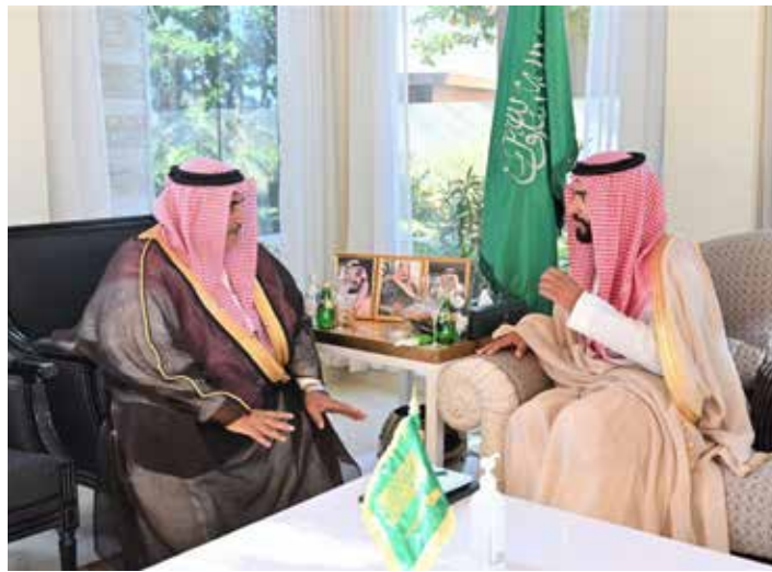
Shaikh Khalid conveying greetings of HM King on the 91st National Day anniversary of Saudi Arabia