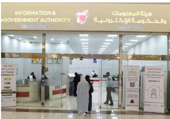
All identity card services the Muharraq branch offers are also available via the National Portal, bahrain. bh.

All beneficiaries are advised to abide by social distancing