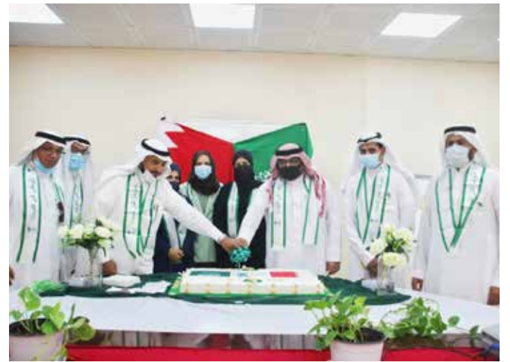
The Director-General of Schools Affairs participates in a celebration of the Saudi educational mission