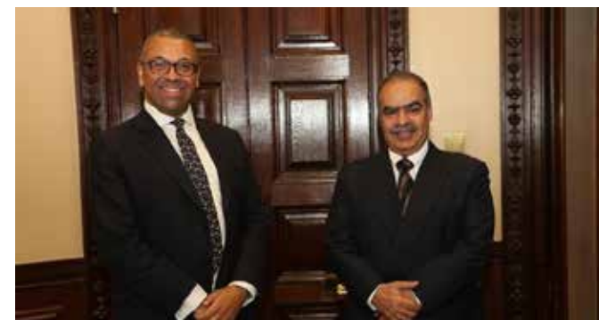
Bahrain's Ambassador to London, Shaikh Fawaz bin Mohammed Al Khalifa, yesterday met the Minister of State for the Middle East and North Africa at the Foreign, Commonwealth & Development Office, James Cleverly, to discuss topics of common interest. Cleverly praised the supportive role played by Bahrain in the evacuation operations from Afghanistan and affirmed ties, especially in the security and defence areas. The two sides also discussed preparations for the British-Bahraini joint working group scheduled to be in London in November 2021

To register for a vaccine or booster shot, visit the BeAware application or the Ministry of Health's website on healthalert.gov.bh.