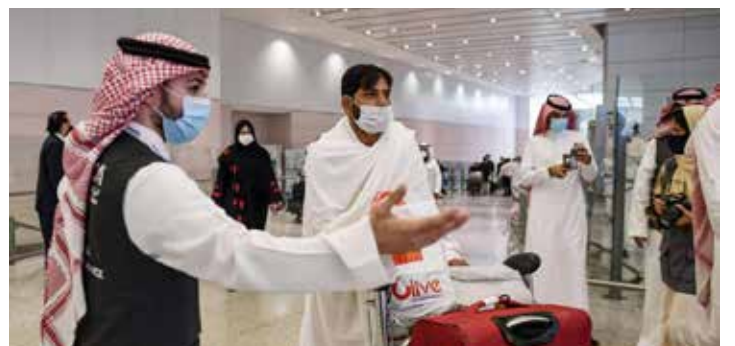
Representative picture

International visitors should register their vaccination status on an online platform 72 hours before travelling to the Kingdom.