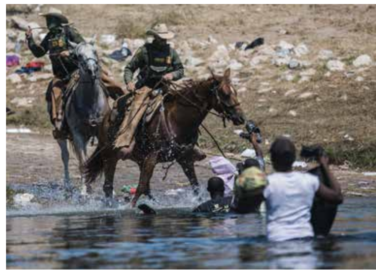
US Customs and Border Protection mounted officers attempt to contain migrants as they cross the Rio Grande from Ciudad Acuña, Mexico

In his resignation letter that Haiti 'has collapsed' and cannot provide refuge for migrants