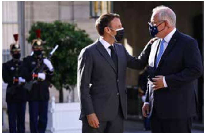
French President Emmanuel Macron greets Australia's Prime Minister Scott Morrison at the Elysee Palace in Paris (file photo)