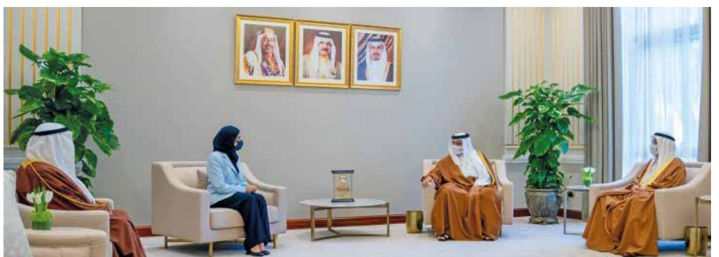
HRH Prince Salman bin Hamad Al Khalifa during a meeting at Gudaibiya Palace with Speaker, Shura Council Chairman and other top officials

His Royal Highness Prince Salman bin Hamad Al Khalifa yesterday called on citizens in the Kingdom to turn their ambitions into reality and challenges into achievements for the comprehensive development of the Kingdom.