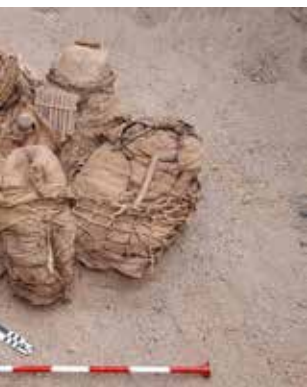
bundles containing the remains of

any whose workers made the discovery, told AFP.