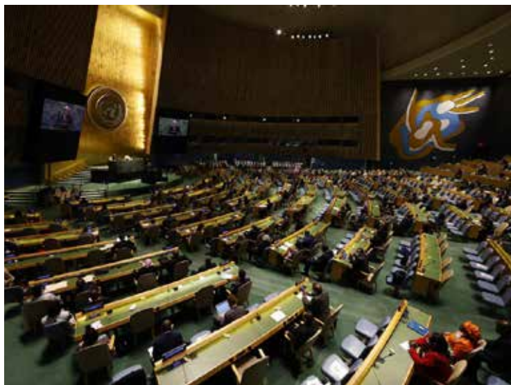
United Nations Secretary-General Antonio Guterres speaks at a High-level meeting during the 76th Session of the UN General Assembly

"It is possible to feed a growing global population while also safeguarding our environment," he said.