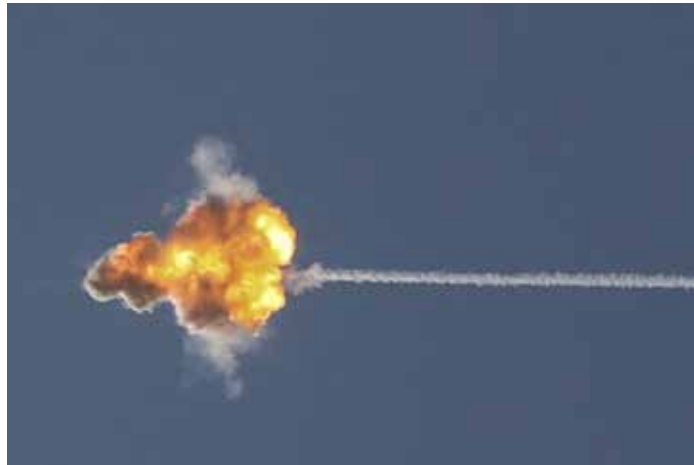
Israel's Iron Dome anti-missile system intercepts a rocket launched from the Gaza Strip towards Israel, as seen from Ashkelon

Some of the most liberal House Democrats had objected