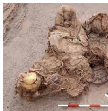
Objects, food, artifacts and ancient funeral eight people unearthed by workers