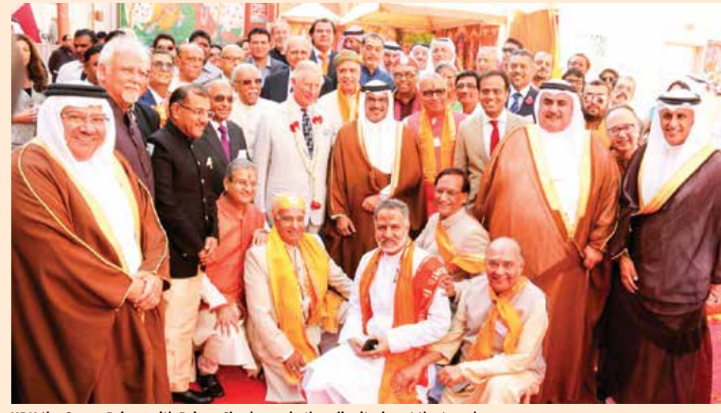
HRH the Crown Prince with Prince Charles and other dignitaries at the temple.

TEL: +973 1740 1013, FAX: +973 1740 1014 .P.O. Box 38893, KINGDOM OF BAHRAIN E-mail: santy@santyconstruction.com Website: www.santyconstruction.com