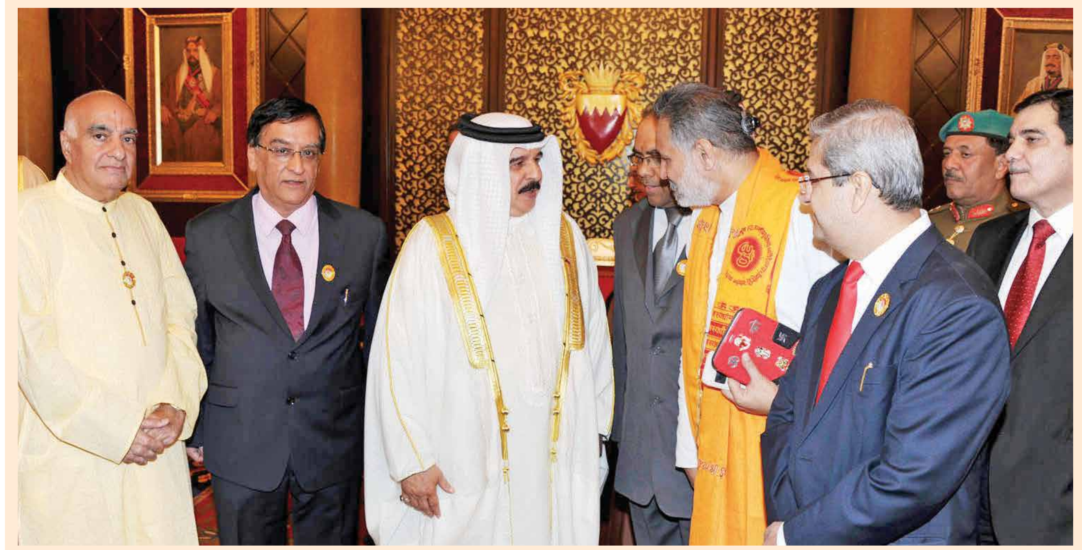
HM the King receiving temple officials.