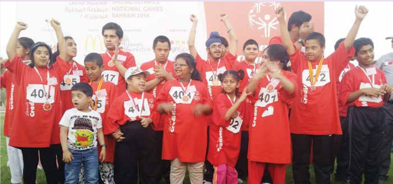
Sneha, is a flagship and dream project of ILA, started in 1987, aimed at providing a safe haven for children with special needs.

cellency the Ambassador of India is the patron of this prestigious Association. The Association provides its 200 plus members with a platform for addressing their many concerns and interests. Members are involved in a number of projects through a series of sub-committees. Visits to old age home, child care home and other rehabilitation centers, form the core of our community activities as does the provision of home-cooked meals & entertainment to expatriate laborers, organizing free medical camps and the running of adult literacy classes. The flagship activity of ILA is the running of Sneha, a center for children with special needs of all nationalities and which is free of charge.