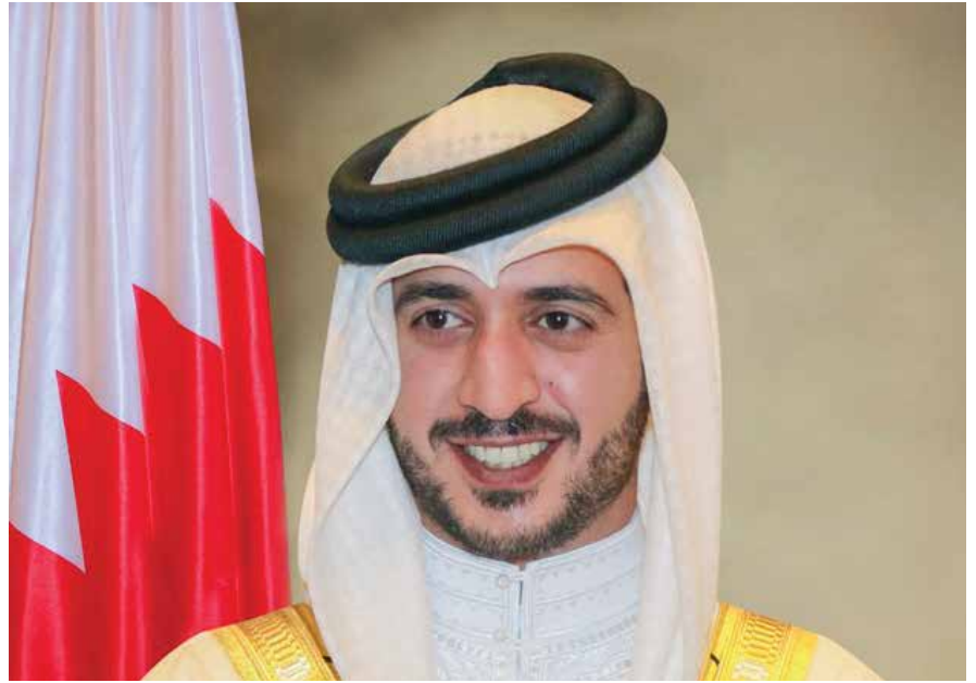
HH Shaikh Khalid

BRAVE CF prides itself in sending athletes from all regions to fight internationally