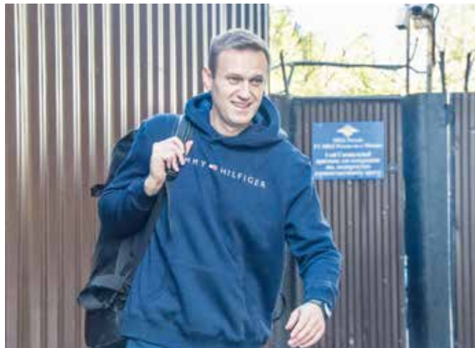
Russian opposition leader Alexei Navalny leaves the detention centre in Moscow