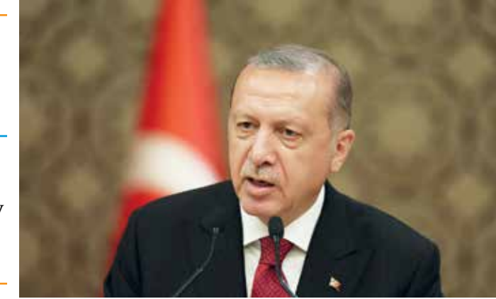
Turkish President Recep Tayyip Erdogan

Cyprus is divided between cep Tayyip Erdogan on Erdogan told a televised press the internationally recognised Thursday hit out at EU conference in the capital An-Republic of Cyprus and a breakaway state set up after the 1974 Turkish invasion, following a