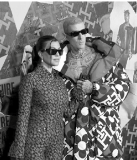
Kourtney Kardashian and Travis Barker

The Kardashians star - who also has Mason, 15, Penelope, 13, and 10-year-old Reign with ex-partner Scott Disick - replied: "Or breastfeeding, eating gelato, focaccia, pasta,