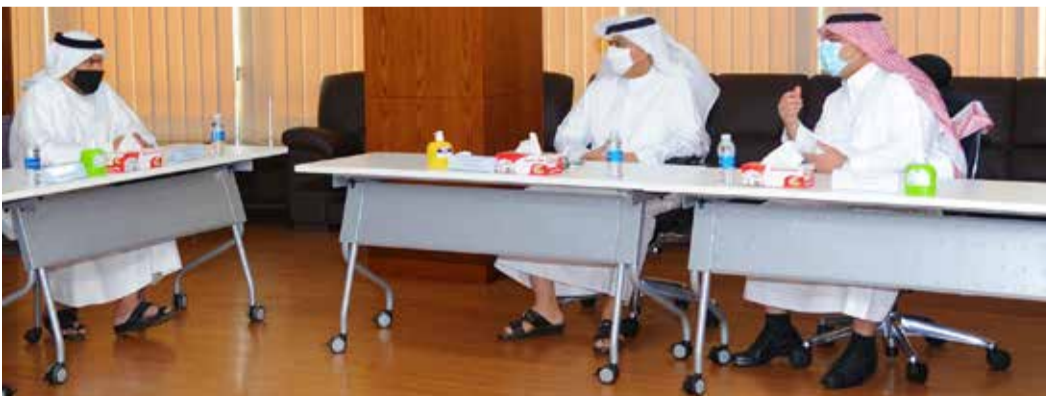
The meeting with Saudi Fund officials

various development phases of the project to develop Bahrain International Airport.