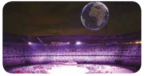
Up above us in the night sky, 1824 drones are being used to form the Tokyo 2020 emblem

Athletes marched to the music of some of Japan's best-selling video games such as Dragon Quest and Final Fantasy, as country names on placards were shown in speech bubbles often used in manga cartoons.