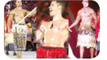
Pita Taufatofua is shirtless again, bearing the flag of Tonga alongside Malia Paseka.