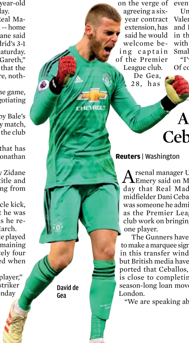
David de Gea

United, who have not lost a match on their pre-season tour so far, beating Perth Glory, Leeds United and Inter Milan, take on Tottenham Hotspur in Shanghai on Thursday.