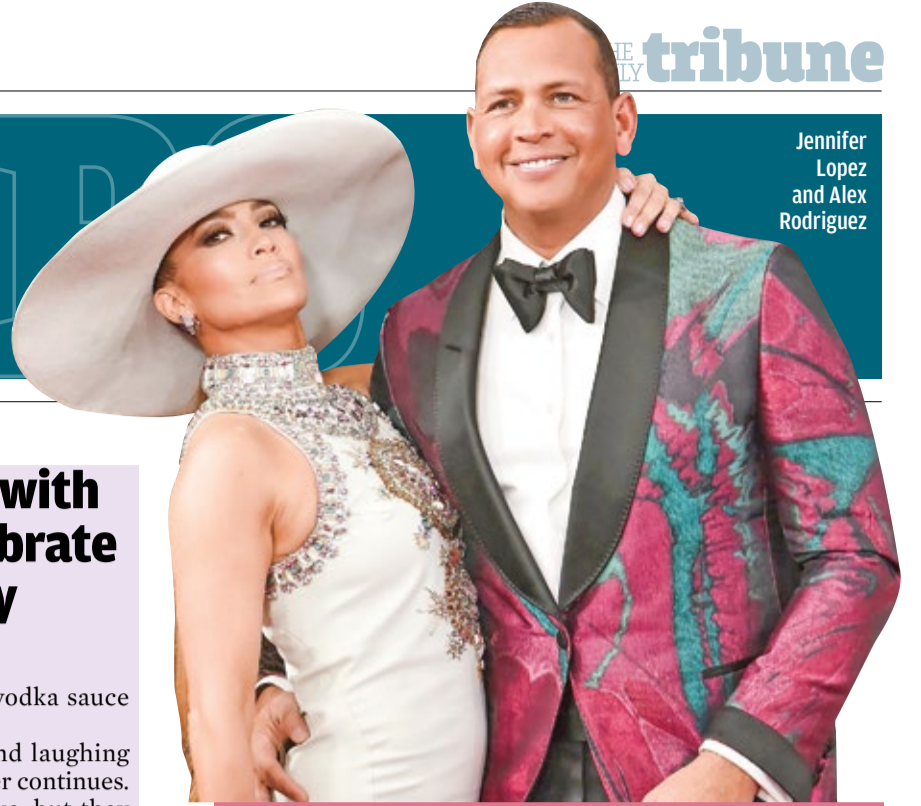
Jennifer Lopez and Alex Rodriguez