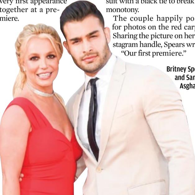
Britney Spears and Sam Asghari

Spears who recovered after being admitted at a mental health facility seemed to be doing fine. She was wearing a stunning scarlet red bodycon dress with a tiny cutout in the middle. Adding more glam to her look was a glittery silver choker necklace and a pair of chunky black heels. Asghari donned a Navajo white suit with a black tie to break the monotony. The couple happily posed for photos on the red carpet. Sharing the picture on her Instagram handle, Spears wrote, "Our first premiere."