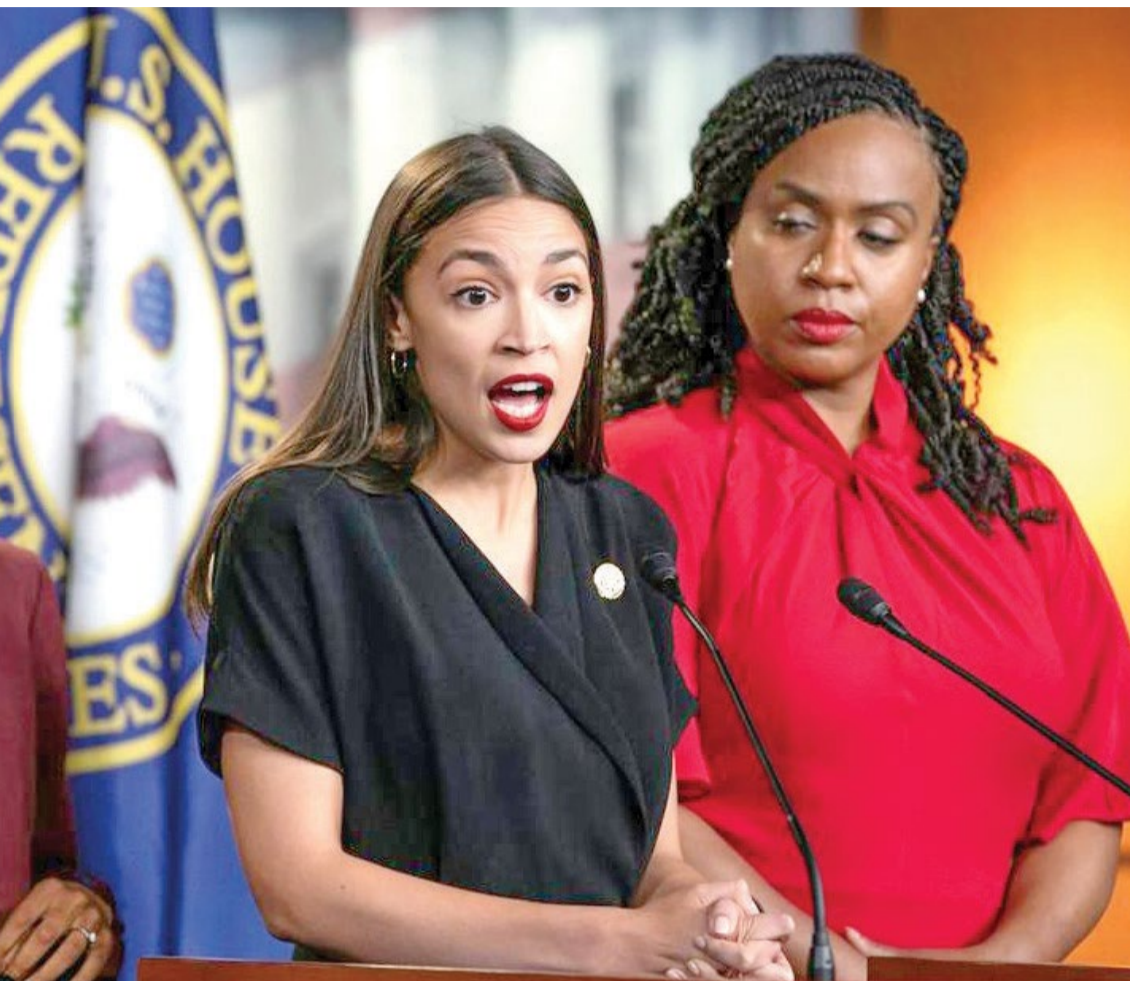
Ayanna Pressley should "go back" to their home countries.

Simeon Saxe-Coburg-Gotha , the last Tsar of Bulgaria when he was a child, is sworn in as Prime Minister of Bulgaria, becoming the first monarch in history to regain political power through democratic election to a different office.