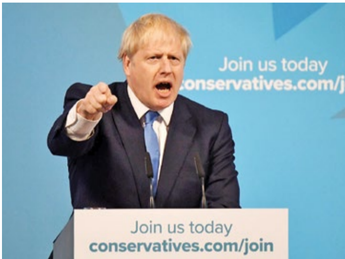
Boris Johnson delivers his victory speech.

billed himself as the man to finally take the UK out of the EU on October 31 - with or without a withdrawal agreement.