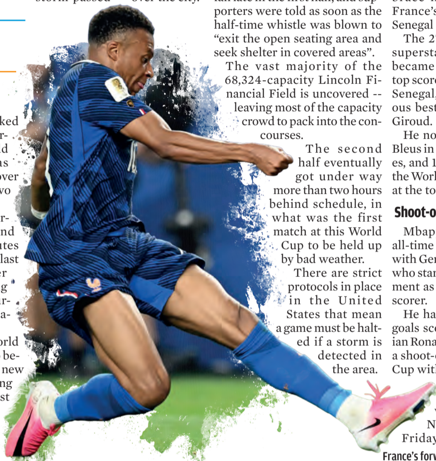
France's forward #10 Kylian Mbappe kicks the ball