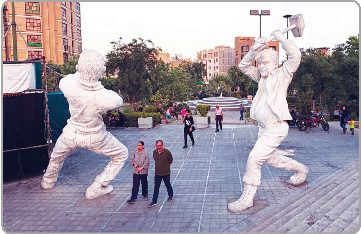
Iranian walks between sculptures of workers in Tehran