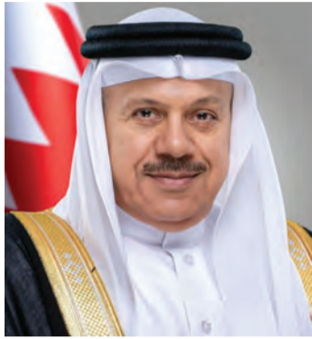
Dr. Abdullatif bin Rashid Al Zayani, Minister of Foreign Affairs

pressed pride in the achievements of Bahraini women throughout the Kingdom's development journey and diplomatic service, attributing their success to the leadership's vision, government support, and the initiatives of the Supreme Council for Women. He noted that these efforts have strengthened women's participation in leadership and decision-making positions across various sectors, particularly in diplomacy.