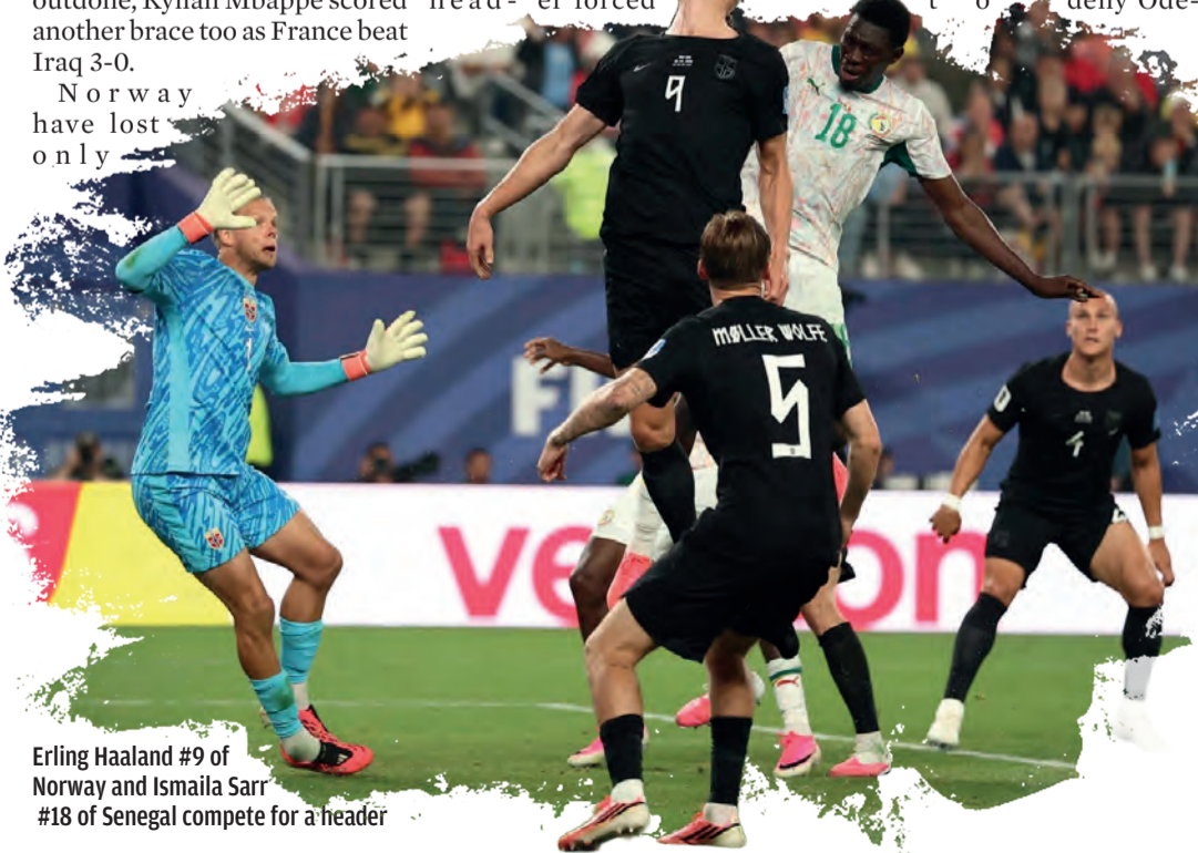
Erling Haaland #9 of Norway and Ismaila Sarr #18 of Senegal compete for a header

Sarr's second of the night set up a tense finish, but Norway held on to join France in the next round and leave Senegal's hopes hanging by a thread.