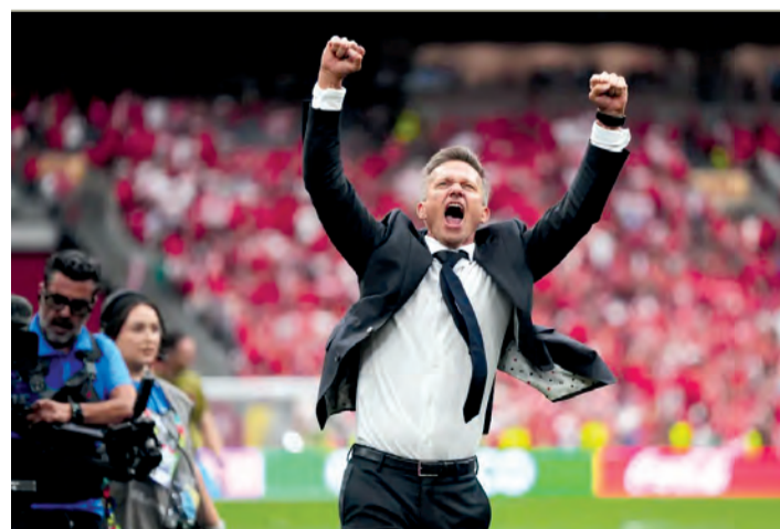
Jesse Marsch, head coach of Canada

The teams enter the contest level on four points after impressive Matchday 2 victories, setting up a clash with major implications at the top of the standings. Canada currently lead the group on goal difference following a ruthless 6-0 demolition of Qatar, while Switzerland sit close behind after a commanding 4-1 victory over Bosnia-Herzegovina.