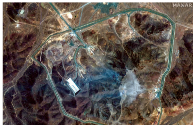
A satellite shows an overview of Fordow underground complex on June 22 in the aftermath of an overnight U.S. strike on the nuclear facility.