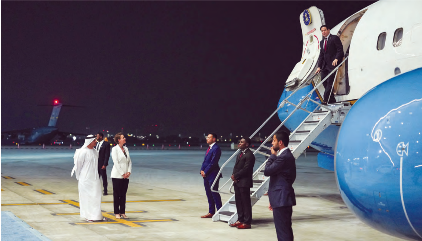
US Secretary of State Marco Rubio disembarks his aircraft upon arrival at al-Bateen Executive Airport in Abu Dhabi, on the first stop of a tour of Gulf states aimed at showing solidarity with key allies hit hard by the Middle East war.