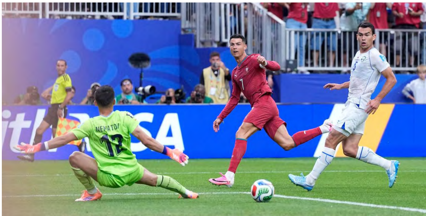
Cristiano Ronaldo on target against Uzbekistan in Houston, Texas