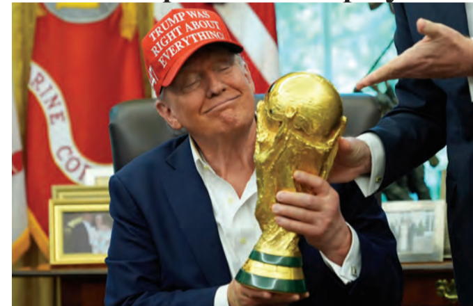
US President Donald Trump with the World Cup trophy