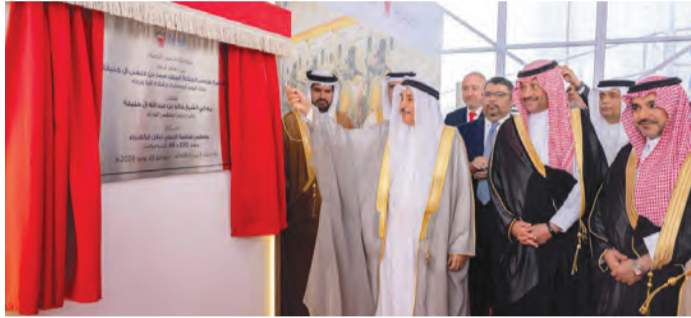
Members representing relevant entities attended the meeting, which was held at the centre's headquarters in Awali.