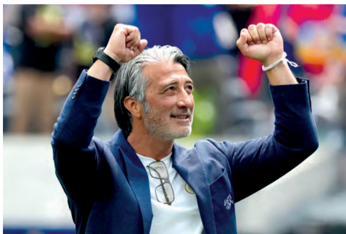
Murat Yakin, head coach of Switzerland