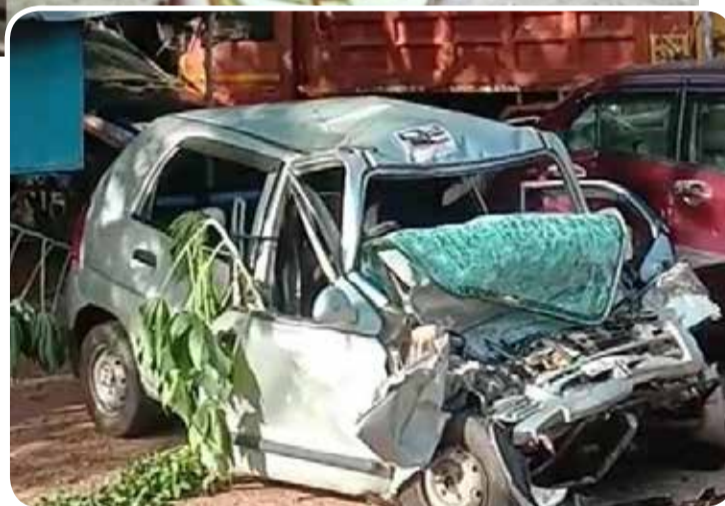
The mangled remains of the car at the accident site

wife, a Bahrain resident and her friends on social media, claiming