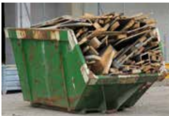
Construction materials make up the bulk of Bahrain's waste

istry of Works, Municipalities Affairs and Urban Planning.