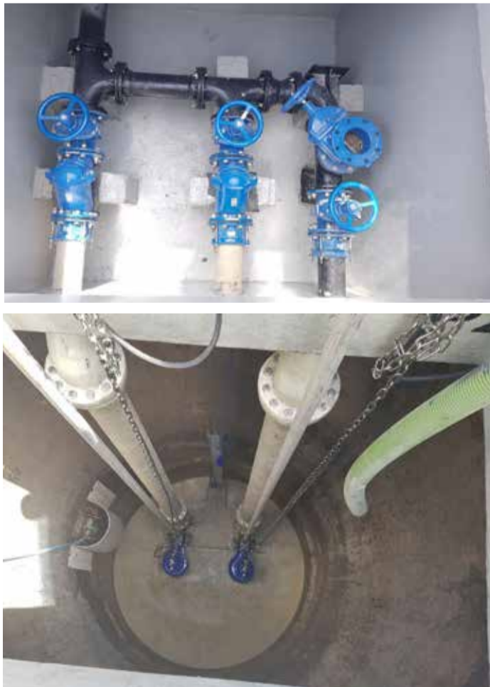
Work is in progress at sewage pumping stations

These stations will be equipped with new pumps, internal pipes, valves, electrical control panels, control systems