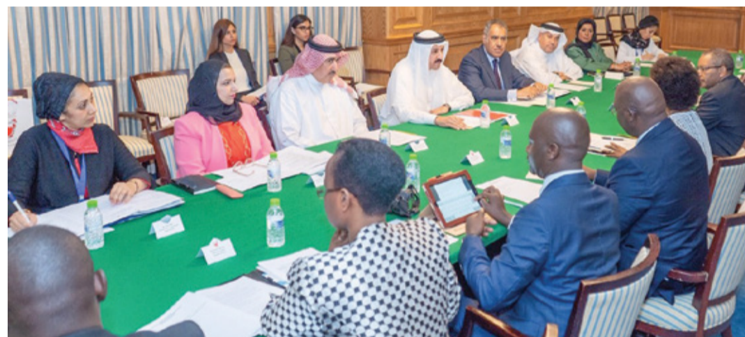
The roundtable meeting in progress.

The Undersecretary for International Affairs highlighted the development and achievements of the Kingdom under the leadership of His Majesty King