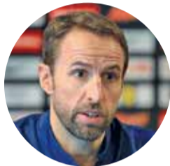
England Coach Gareth Southgate

The England manager has no reason to make any further changes, although might be tempted to rotate Jordan Henderson and Eric Dier, Ashley Young and Danny Rose and Harry Maguire and Gary Cahill.