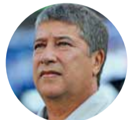
Panama Coach Hernan Darío Gomez

Roman Torres overcame a slight knock to face Belgium in their group opener and will be fine to continue here. Head coach Hernán Darío Gómez is expected to use a compact setup to try and frustrate Belgium.