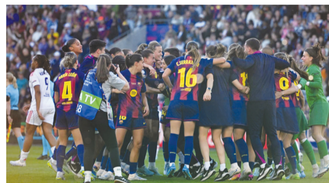
FC Barcelona players celebrate winning the UEFA Women's Champions League final football match between FC Barcelona and Olympique Lyonnais (OL) at the Ullevaal Stadium in Oslo, Norway