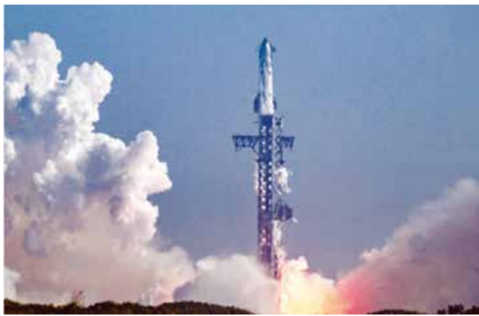
SpaceX's Starship 39 rocket launches from Starbase during the 12th test flight as seen from South Padre Island, Texas

SpaceX primarily aimed to demonstrate its redesigns in flight.