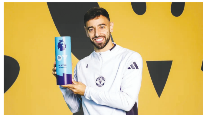
Bruno Fernandes with the award after his standout Premier League campaign