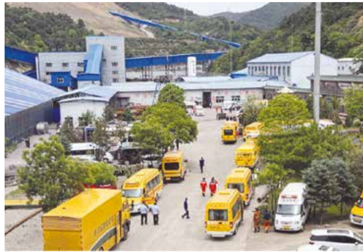
A general view of rescue team members and emergency vehicles arriving at the Liushenyu coal mine after a gas explosion in Changzhi, in northern China's Shanxi province

At least 82 people had died and 123 others were sent to hospital for treatment, four of whom were in critical or severe condition, state broadcaster CCTV said. Of those sent for treatment, 33