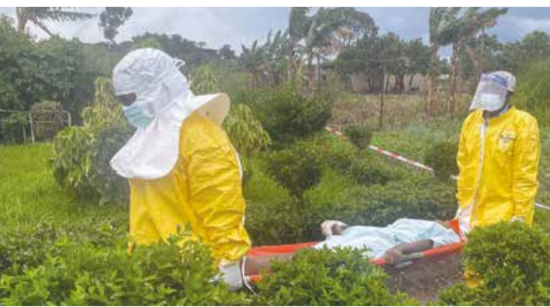
Medical staff wearing personal protective equipment (PPE) carry a patient at a hospital in Rwampara on May 23, 2026

To mobilise the response, Tedros approved an additional $3.4 million from the WHO Con-