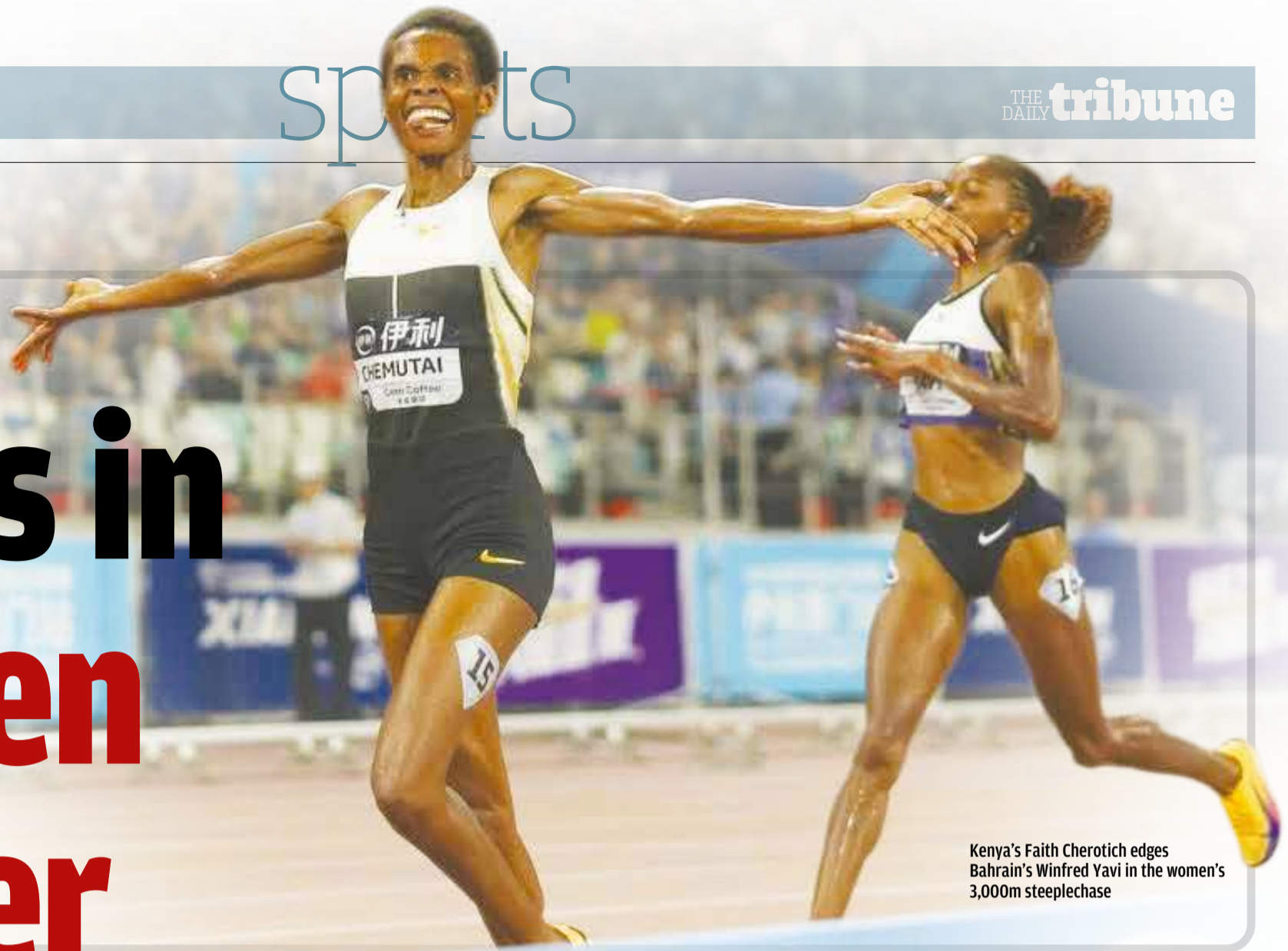
Kenya's Faith Cherotich edges Bahrain's Winfred Yavi in the women's 3,000m steeplechase