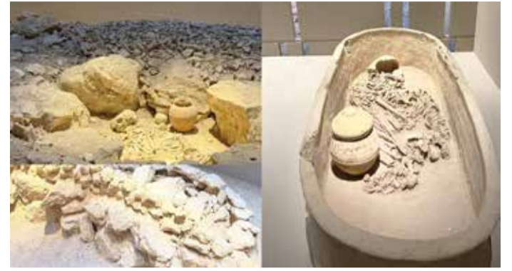
Ancient burial chambers at the Hall of Graves in the Bahrain National Museum showcase Dilmun-era funerary traditions.

Museum guide Yusuf Al-saeed explained that civilizations across the ancient world believed Dilmun was the "last paradise," drawing people from distant lands and ancient trading