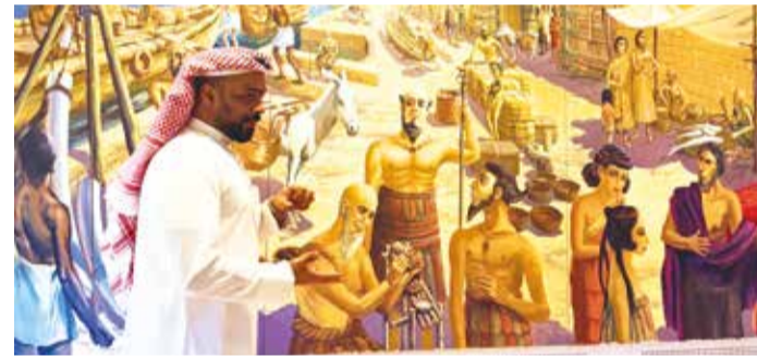
Museum guide explaining the ancient Dilmun trade system to visitors

Visitors also learned how archaeologists study bones and pottery to uncover the origins of those buried. Bahrain's ancient spring water contained high fluoride levels, leaving distinct marks on bones and helping researchers determine whether individuals had lived on the island or arrived from abroad.