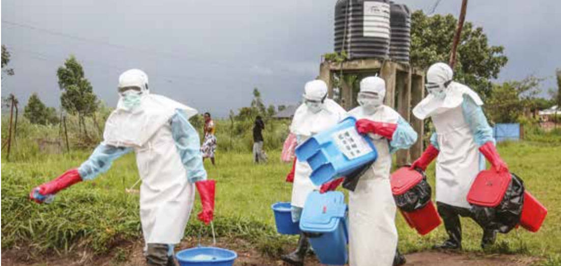
Medical staff wearing personal protective equipment (PPE) carry disinfectant at the hospital in Rwampara