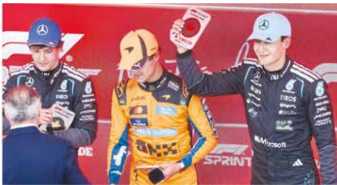
First place Mercedes' British driver George Russell (R), second place McLaren's British driver Lando Norris (C) and third place Mercedes' Italian driver Kimi Antonelli receive their plaques after the Sprint race ahead of the 2026 Formula 1 Grand Prix du Canada at Circuit Gilles-Villeneuve in Montreal, Canada

It was the first sprint race held at the Circuit Gilles Vil-