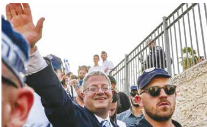
Ben Gvir (C) caused international outcry by publishing a video of aid activists from the Global Sumud Flotilla being mistreated

The ban follows a global outcry after Ben Gvir published a video on Wednesday showing the heavy-handed treatment in Israeli custody of foreign activists from the flotilla.