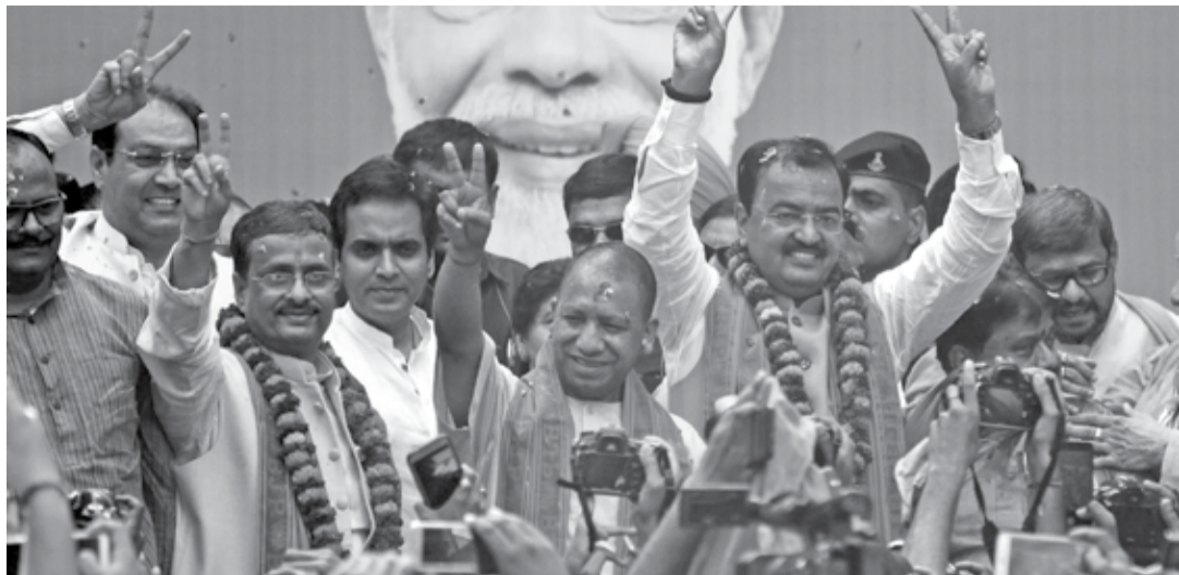
Chief Minister of Uttar Pradesh Yogi Aditya Nath (C) flashes the victory sign to supporters along with Deputy Chief Ministers Keshav Prasad Maurya (R) and Dinesh Sharma (3L) during the party's victory celebration at party office in Lucknow