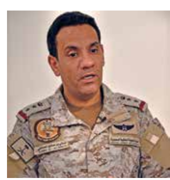
Colonel Turki al-Maliki

sirah TV said the attack -- the sets in Saudi Arabia and on Sun- week, according to Saudi and