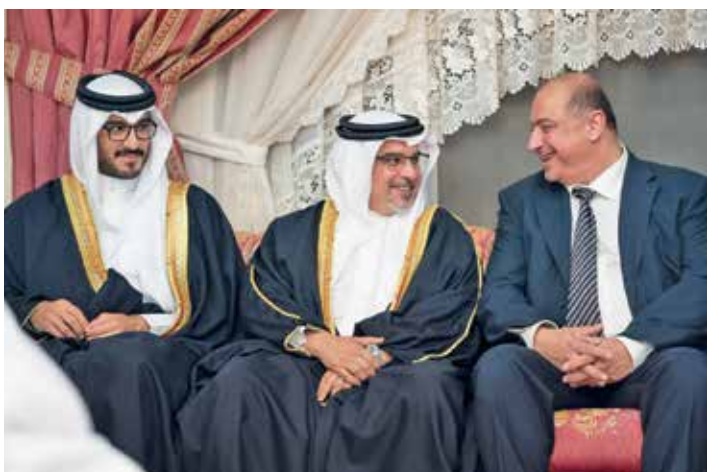
Deputy King HRH Prince Sal- Deputy King during a Majlis visit yesterday evening

His Royal Highness also hailed the collective efforts exerted by the citizens of Bahrain in overcoming challenges.