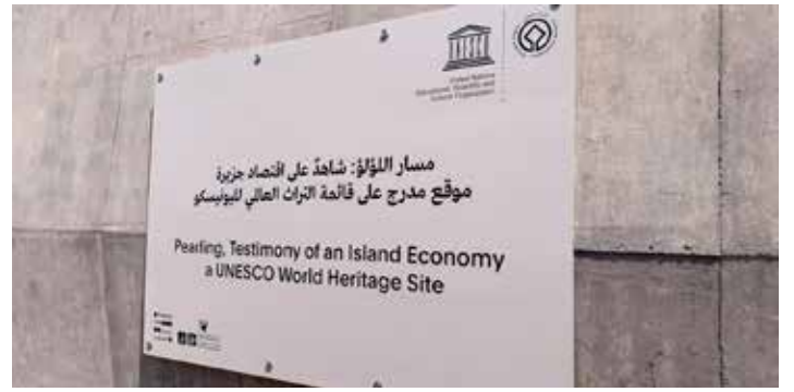
The Unesco World Heritage Site "Pearling, Testimony of an Island Economy"

The Pearling Path Visitor Center is one of the main stops on the site, as it contains historical parts and remains the