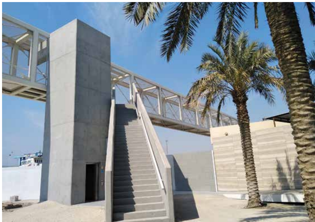
Pearl Path bridge

As of 2012, "Pearling, Testimony of an Island Economy" has become the second World Heritage Site of Bahrain as the testimony of its millennia old pearl collecting tradition and the globally significant single-product island economy and social system it produced.