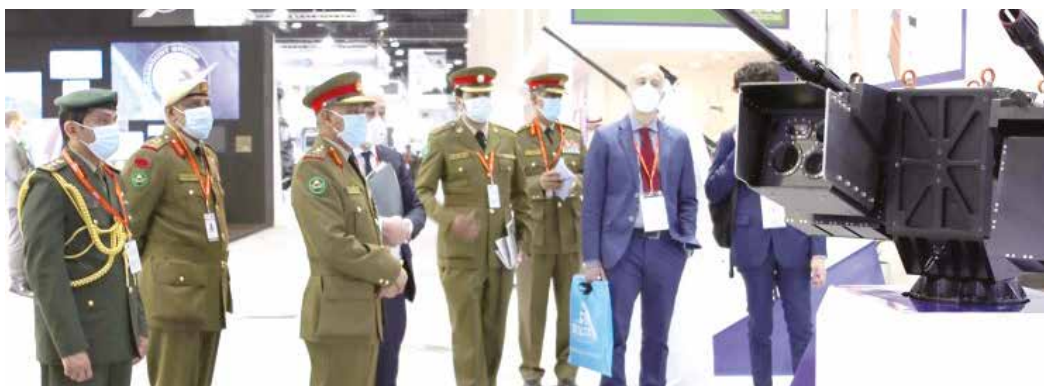
Lt-General Al Nuaimi tours the exhibition