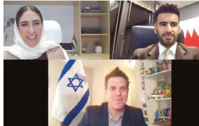
The online discussion in progress

The Bahraini Embassy stressed that achieving peace is the strategic choice for Bahrain, adding that the reform