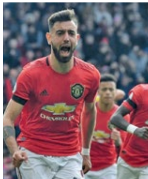
Bruno Fernandes celebrates his first goal