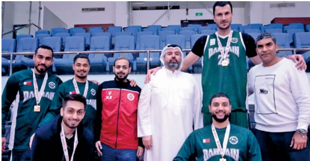
Bahrain Club team members with officials at the awarding

Al Hala took the bronze medals after defeating Manama 21-11 in the game for third place.