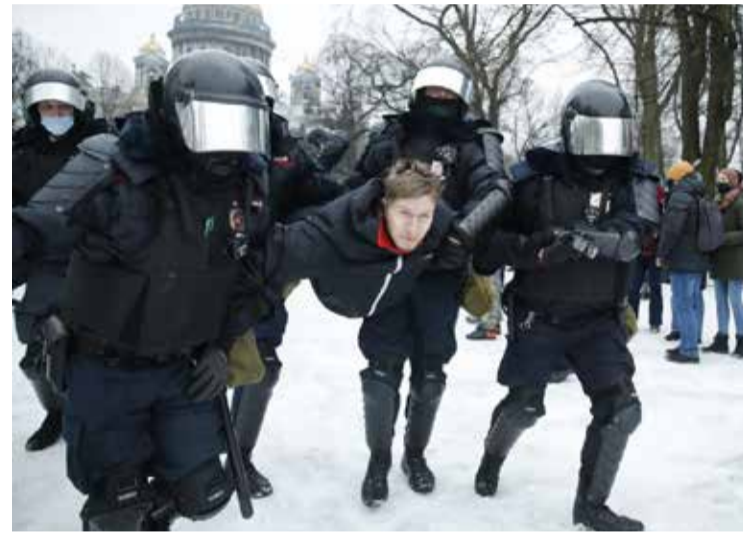
Police detain a man during a protest against the jailing of opposition leader Alexei Navalny in St. Petersburg, Russia

Police detained over 1,500 people and used force to break up rallies around Russia yesterday as tens of thousands of protesters demanded the release of Kremlin critic Alexei Navalny, whose wife was among those detained.