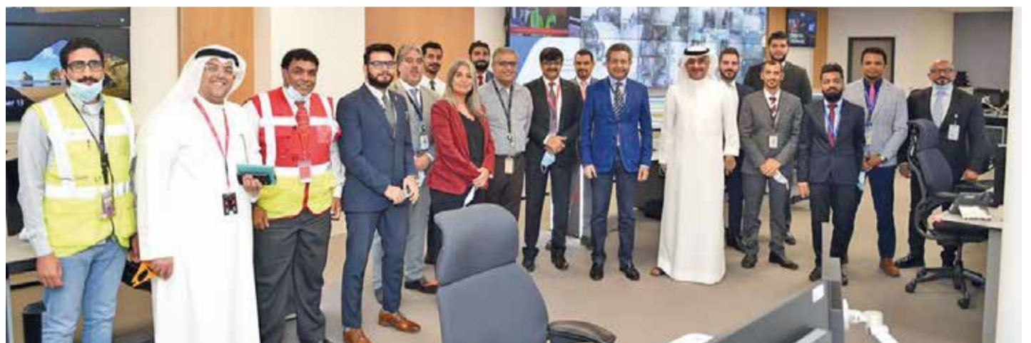
Kamal Ahmed, the Minister of Transportation and Communications, Chairman of the Board of Directors of Bahrain Airport Company, during a visit to the new terminal at Bahrain International Airport

"It is a matter of our great pride in the Ministry of Transportation and Communications and the Bahrain Airport Company that this huge development project has come to light under the leadership of a team consist-