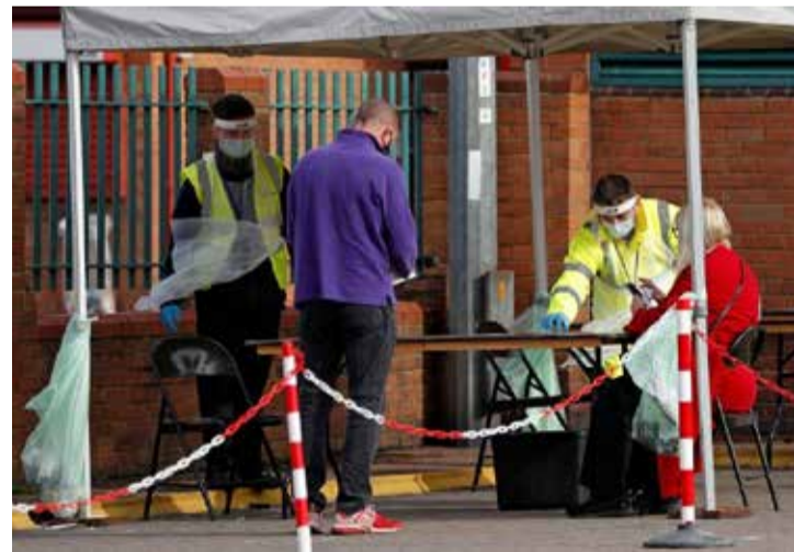
A member of the public gets a coronavirus COVID-19 test in London

Virus deaths have risen 16 percent over the past week, while the number of people hospitalised with Covid-19 is approaching double the number seen during the worst days of the first wave of the pandemic in April.