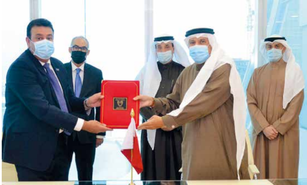
A group photo session after signing the deal extension

“This also calls for the need to devise more training programmes that could attract Bah-