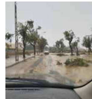
Fallen tree branches on a muddy street after cyclone Eloise