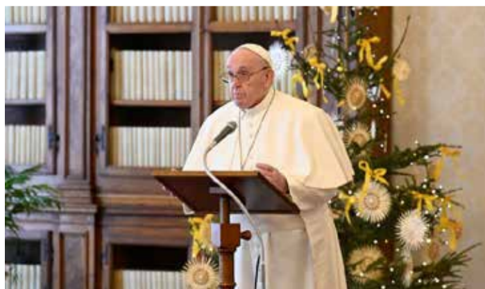
Pope Francis leads Angelus prayer on Epiphany at the Vatican

Still, Francis said Paul was at his best while preaching in per-