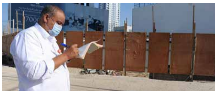
A capital municipality official in action.