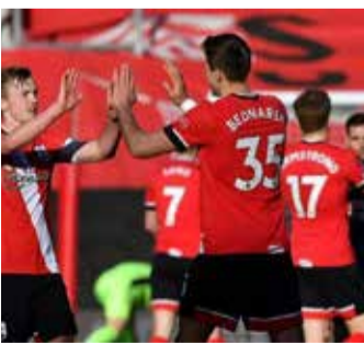
Southampton players celebrate their FA Cup fourth-round win against Arsenal

In the early kick-off at St Mary's Stadium, Arsenal paid the price for a sluggish start