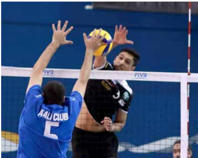
Action from Bani Jamra's win over A'ali

In yesterday's other match, Bani Jamra claimed a rare league victory. They had a good