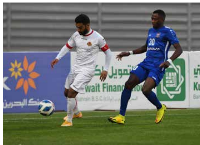
Action from East Riffa's match with Manama

Meanwhile, Al Najma found the net twice within a game-changing, 12-minute span in the second half to escape with a stunning 2-1 win over Mu-