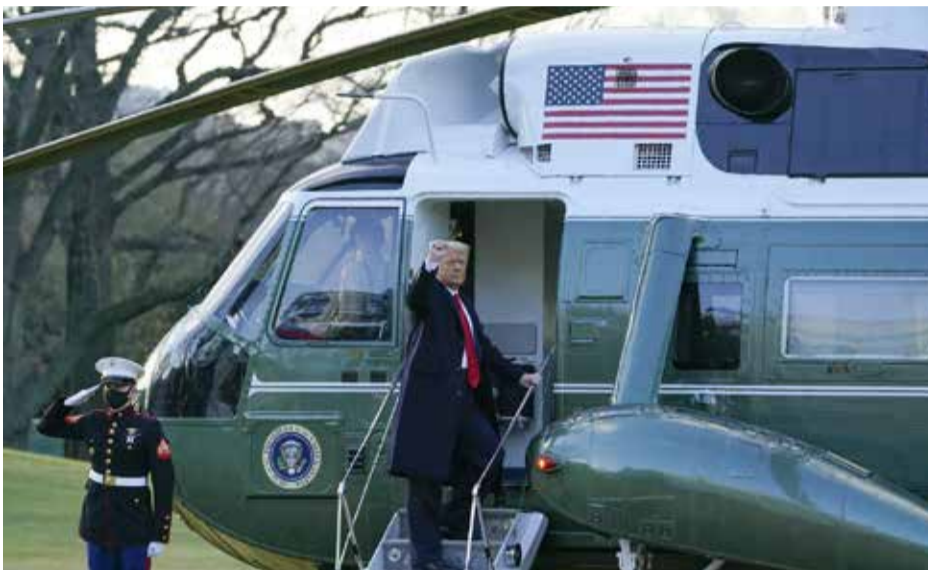
US President Donald Trump boards Marine One as he departs the White House (file photo)