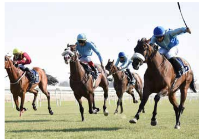
Thrilling action at REHC

TDT: What potential do you see in Bahrain for globally renowned trainers like yourself?