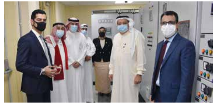
Minister with other officials during a visit to the new station

The upper reservoir is covered with aluminium sheets, taking into account the urban