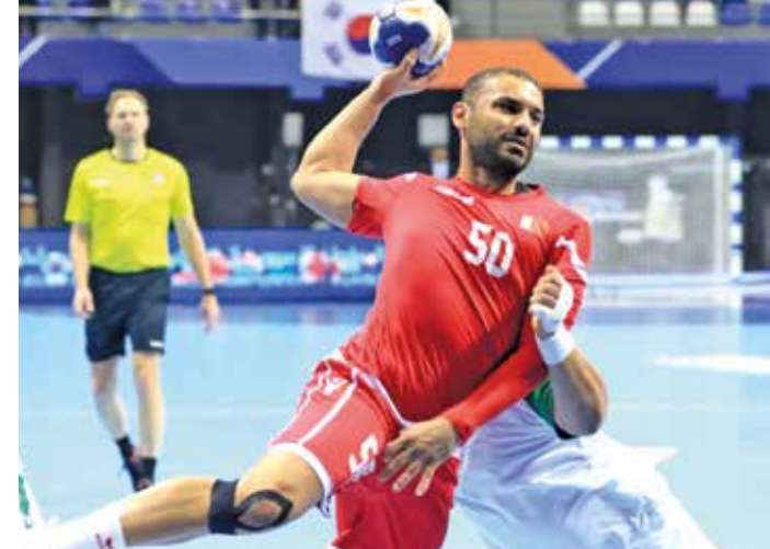
Bahrain's Almagabi attempts to score against Saudi

round in third place with one which the Qataris won to claim victory and they now play in the gold medals. Bahrain will