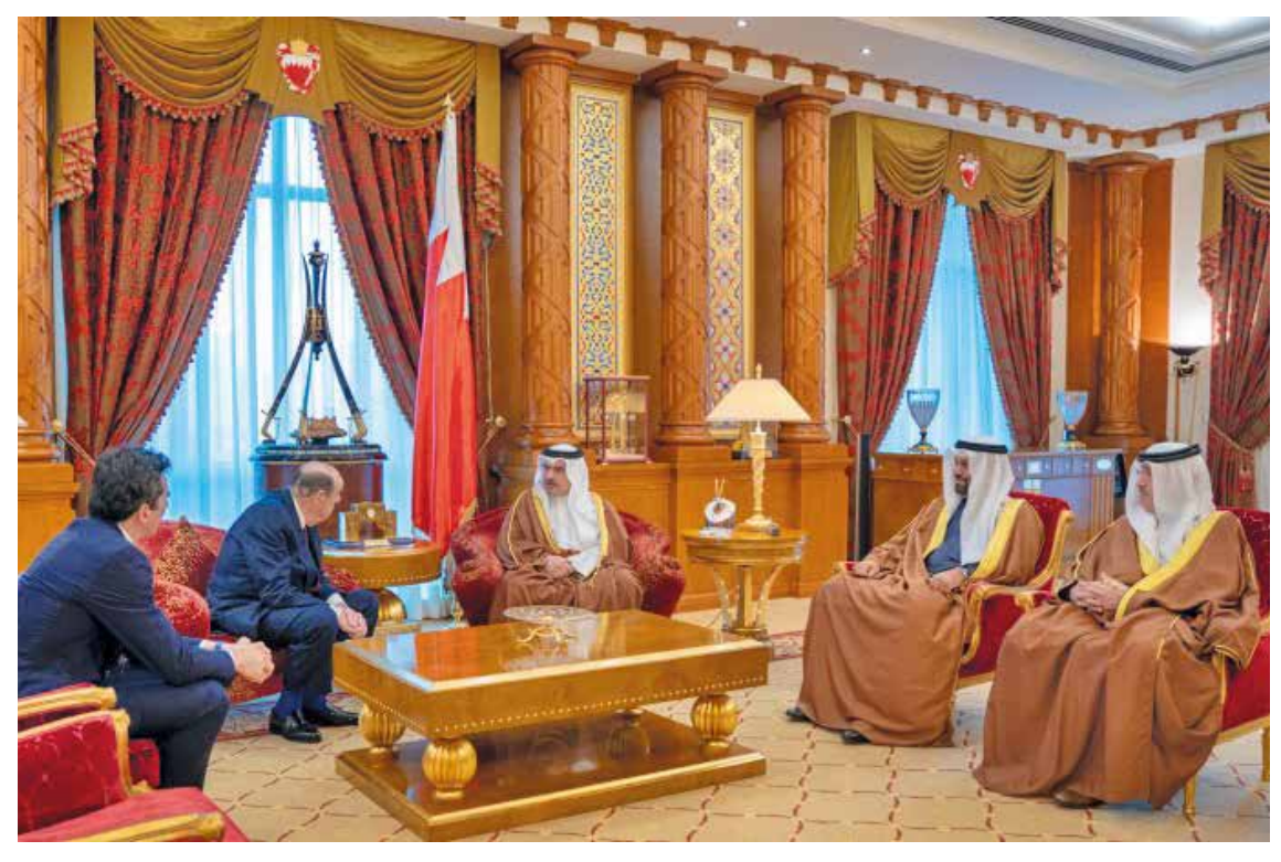
The Deputy King, His Royal Highness Prince Salman bin Hamad Al Khalifa, with Sir Arthur Nicholas Winston Soames, at Gudaibiya Palace. Prince Salman highlighted the broad-ranging bilateral ties, stressing the continuous growth in cooperation across all fields with the support of His Majesty King Hamad bin Isa Al Khalifa. For his part, Sir Arthur expressed gratitude for the opportunity to meet HRH the Deputy King and hailed HRH's continued support to bolstering Bahrain-UK relations.