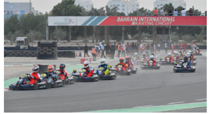
Action from a previous karting race at BIKC