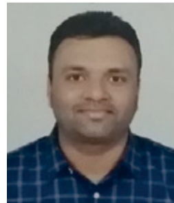
Shyju - Matrix