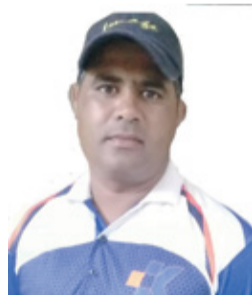
Imran kooheji Contractors

Other Team scores Matrix 176/3 (Shyju 68, Danushke 57) beat Suha Travels 166/10 Usman 21, Danushke