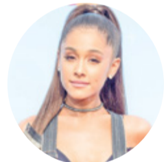
Ariana Los Angeles

Ariana Grande took to Instagram and released the tracklist for her fifth studio album, "Thank U, Next."