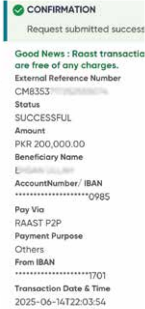
Victim's payment transactions with the scammer