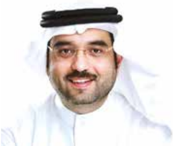
MP Ahmed Al-Salloum

MP Al-Salloum highlighted that delivering these housing services, as part of the broader plan to reach 50,000 housing units, represents a practical step toward reducing waiting periods, strengthening public confidence in government programs,