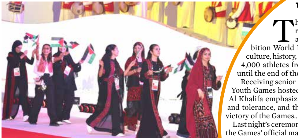
Palestinian delegation applauded