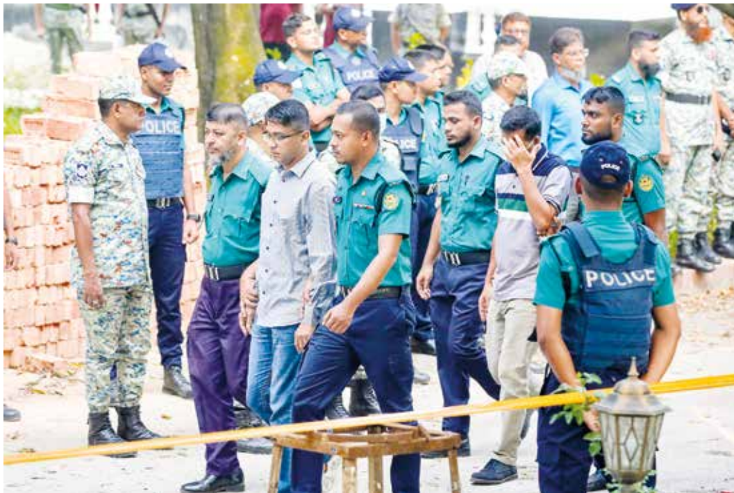
Police personnel escort detained army officers to the International Crimes Tribunal (ICT) court in Dhaka

All have served in Bangladeshi military intelligence or the feared paramilitary Rapid