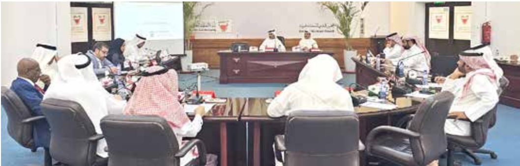
Southern Municipal Council session in progress