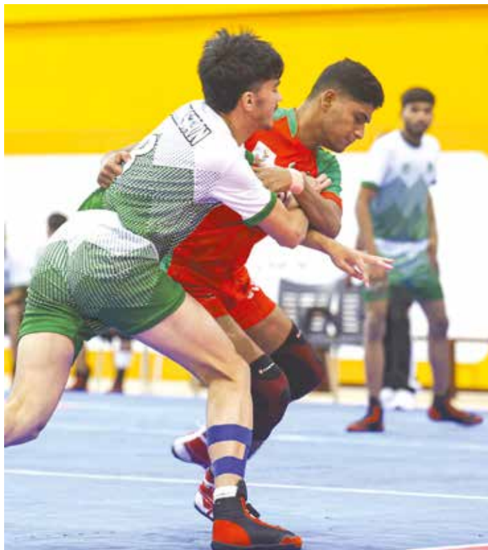
Action from Kabaddi match between Bangladesh and Pakistan