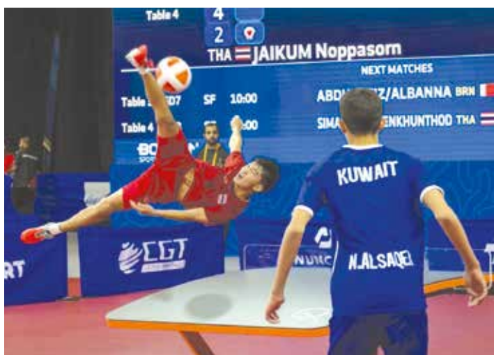
Thailand attempts an audacious overhead-kick in teqball vs Kuwait