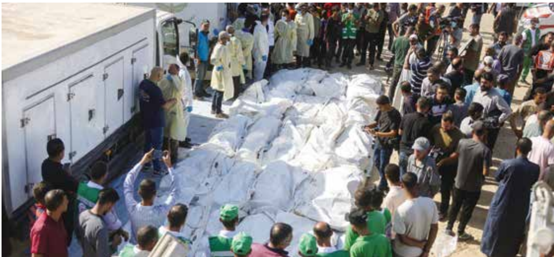
The remains of unidentified Palestinians lie outside Nasser Hospital in Khan Yunis, in the southern Gaza Strip, after their bodies were returned by Israel under a US-brokered ceasefire deal

laid out on the floor in white body bags as rescue workers stood in a line to pray over the dead.