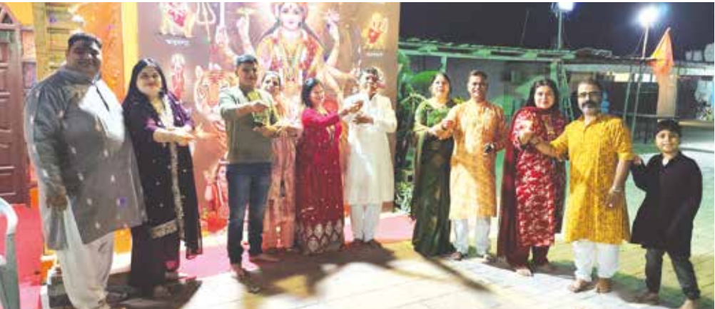
The Festival of Lights, the biggest vibrant Hindu Festival, was celebrated with great devotion and tradition at the Durga Mata Mandir, located in the Bramco Premises, Bahrain. Hundreds of enthusiastic devotees and children from Bahrain and nearby countries gathered to pray to Goddess Lakshmi. The atmosphere was filled with spiritual fervor as rituals and prayers were performed in honor of Goddess Durga, invoking blessings for the peace, prosperity, and well-being of the citizens of this lovely island.