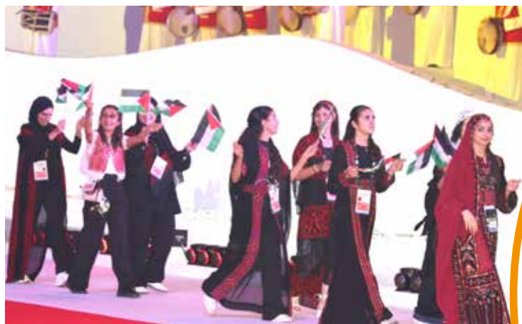
Palestinian delegation applauded