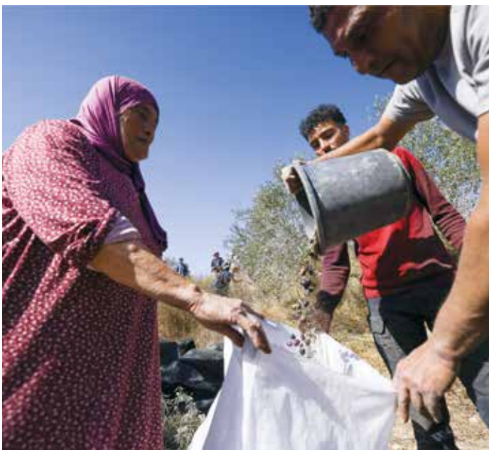
Palestinians harvest olives in the occupied West Bank village of Turmus Ayya, on the outskirts of Ramallah

declared the area we were harvesting in as a military zone," he said, alleging that this was a common Israeli tactic against Palestinians.