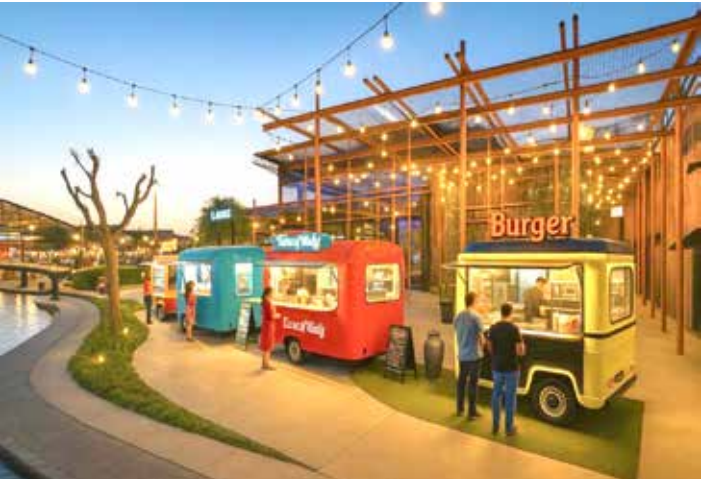
An artist's rendition of the project

Each pitch would have central connections for electricity and water, a sewer tie-in and regulated grey water disposal. The plan calls for smart bins for recycling, CCTV coverage and emergency response arrangements with Civil Defence. Licensing would be issued by one regulator, with hygiene rules applied across the site. Backers say the venue is