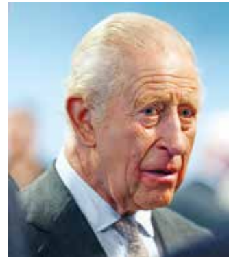
Britain's King Charles III

a significant moment in relations between the Catholic Church and Church of England, of which His Majesty is Supreme Governor", Buckingham Palace said.