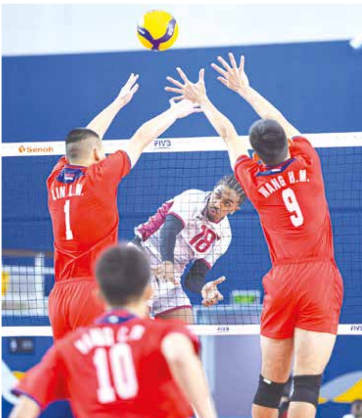
Action from Volleyball match between Qatar and Chinese Taipei