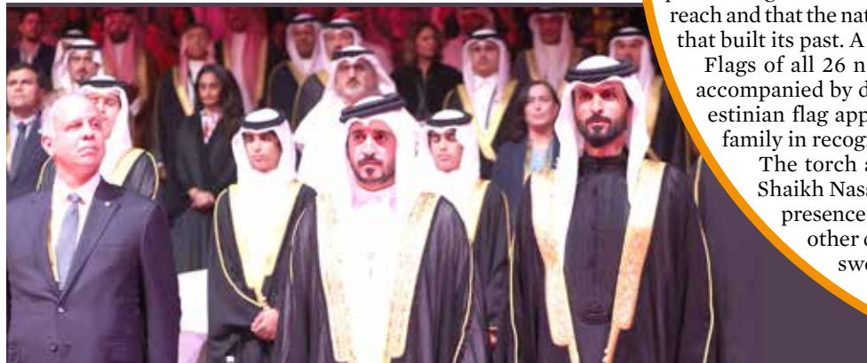
HRH Prince Faisal bin Al Hussein of Jordan, left, with HH Shaikh Khalid and HH Shaikh Nasser