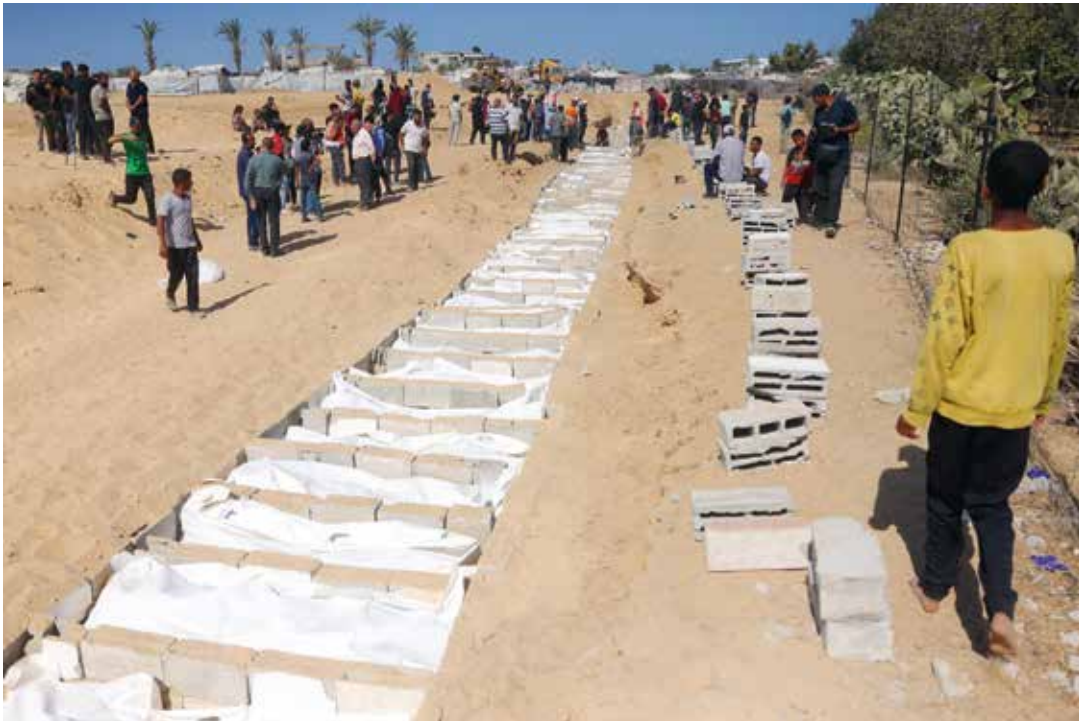
The remains of unidentified Palestinians are buried at a cemetery in Deir al-Balah, in the central Gaza Strip

AFP footage from Nasser Hospital showed dozens of bodies