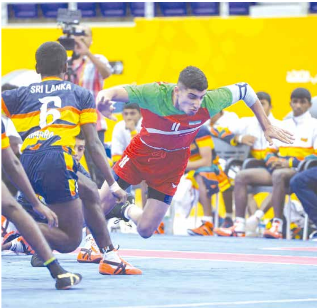
Iran in dominant kabaddi action against Sri Lanka