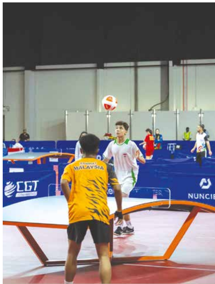
Iran in fast-paced teqball exchanges against Malaysia

At Isa Sports City Hall D, kabaddi produced some of the day's most eye-catching results. Bangladesh extended their unbeaten run with a 56-29 victory over Pakistan, opening a 27-14 lead at halftime and maintaining control throughout. Bangladesh recorded 14 outs and seven bonuses, while Pakistan managed three super tackles in a spirited effort.