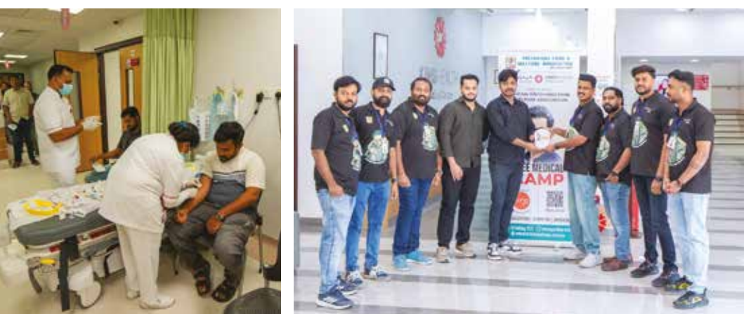
The Prithviraj Fans Bahrain Unit and KIMS Health Medical Center jointly organized a highly successful free medical camp to mark the birthday of Prithviraj Sukumaran, a prominent Indian actor, director, and producer primarily known for his work in Malayalam cinema. Over 400 people participated in this community service event. The Fans Unit extended its gratitude to all participants and KIMS Health Medical Center for their support.