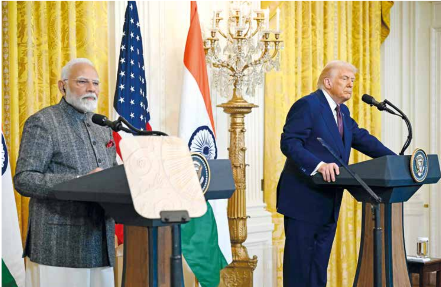
US President Donald Trump and Indian Prime Minister Narendra Modi hold a joint press conference in the East Room of the White House in Washington, DC, on February 13, 2025

talked about a lot of things, but mostly the world of trade," Trump said while lighting candles for the celebration at the White House. "He's very interested in that."