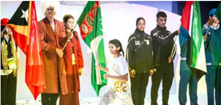
Flame of unity