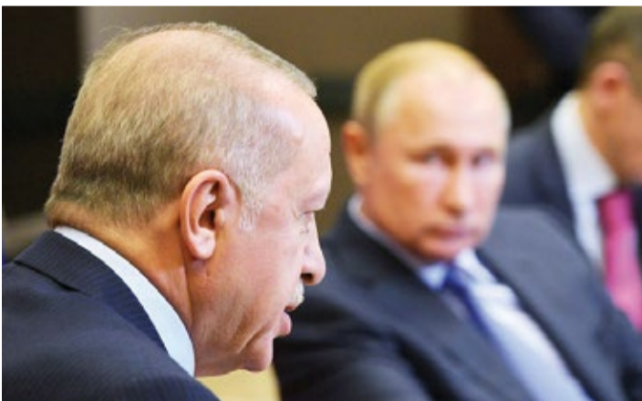
Turkish President Recep Tayyip Erdogan speaks during a meeting with Russian President Vladimir Putin in Sochi, Russia.

Russia, Turkey reach 'historic' deal on Syria border