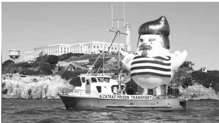
The inflatable 'Trump Chicken' dressed as a prisoner

The Trump Chicken reportedly first made its debut last year during the San Francisco Tax March and even came to the