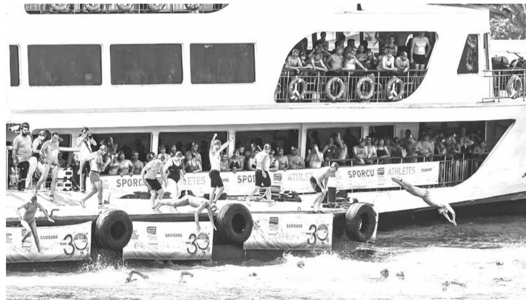
Swimmers jump in the Bosphorus river as they take part in the Bosphorus Cross Continental Swim event

The Bosphorus is usually thronged with oil tankers, cargo ships and ferries making it one of the most choked shipping lanes in the world.