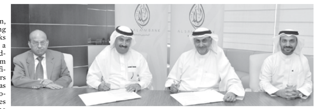
Al Salam Bank and Kingdom Properties officials during the signing ceremony

Present at the signing cerequarter office in the Bahrain of Al Salam Bank-Bahrain and facilities. In addition, customers community development with World Trade Center were: An- Kingdom Projects and senior who are not eligible for Mazaya its recreational parks.