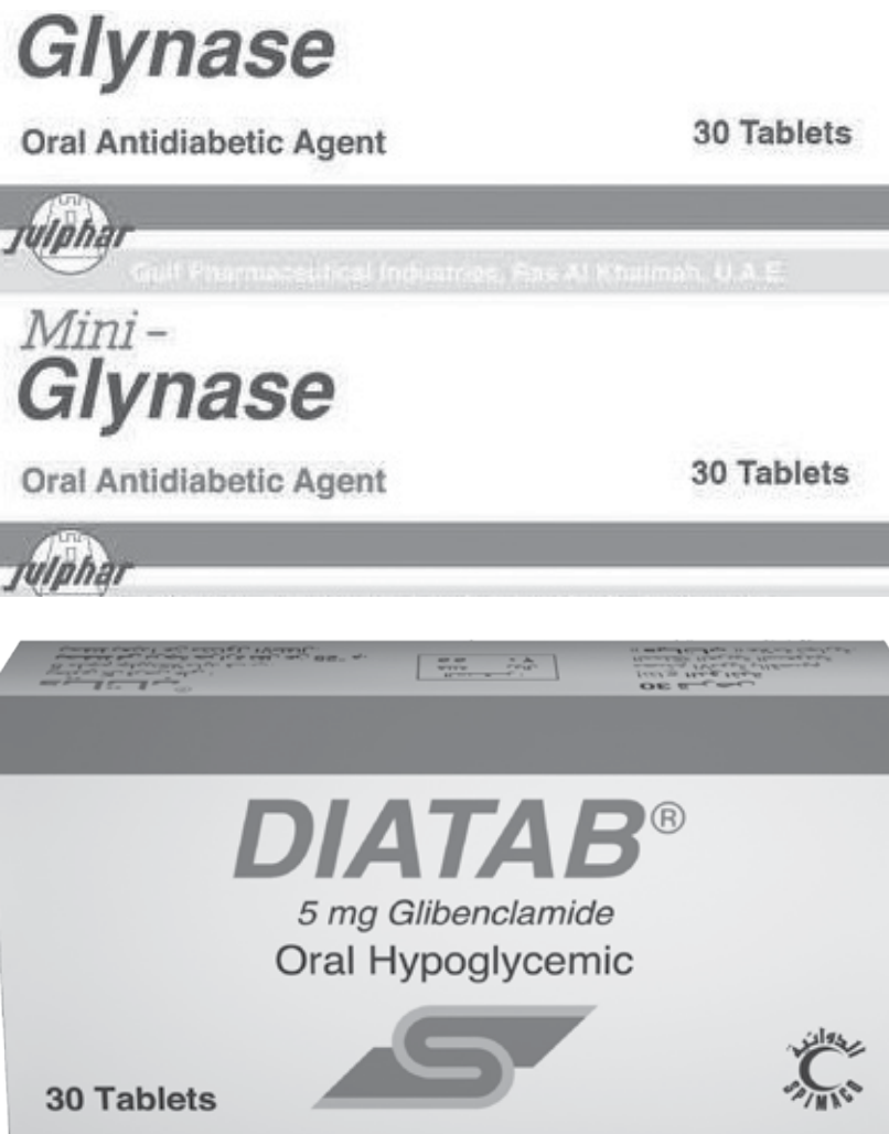
Authorities have urged consumers not to purchase Glynase 5mg and Diatab 5mg tablets.