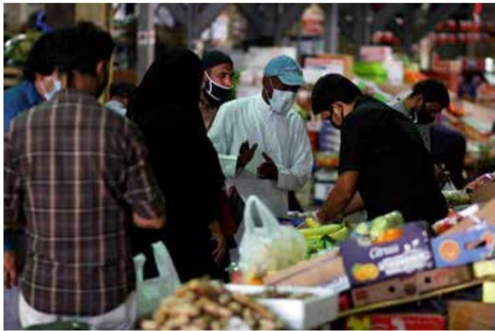
Food stocks in Bahrain are sufficient