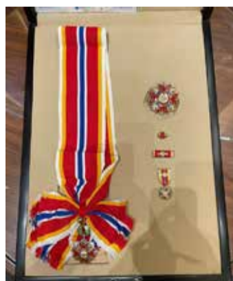
The Order of Sikatuna medal

in particular the International Covenant on Migrants at the United Nations.