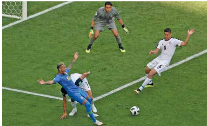
Neymar claims for a penalty as he goes down after the slightest of touches from Giancarlo Gonzalez

The Dutch referee Bjorn Kuipers initially awarded a penalty but was alerted to check the replay by VAR, and after reviewing the incident on a screen, overturned his decision.