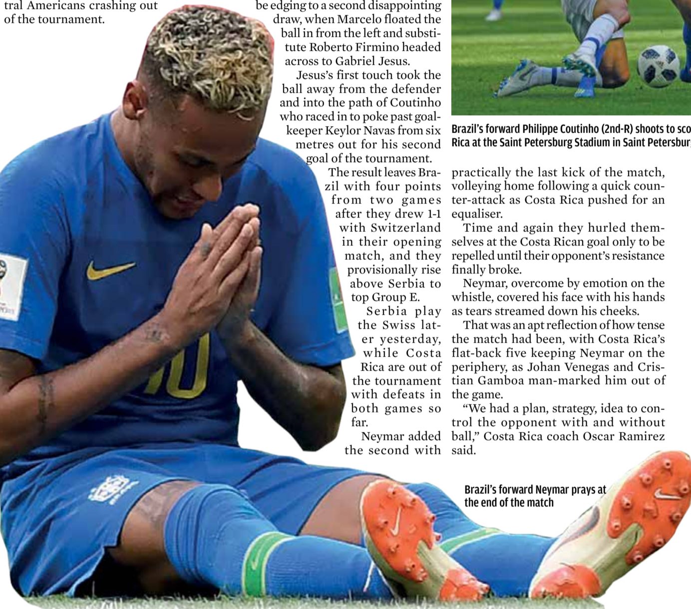
Brazil's forward Neymar prays at the end of the match