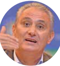
BRAZIL COACH TITE

"The first half was difficult. But in the second half, we couldn't have done any more. If we have suffered in these first two games, it is simply because this is a World Cup"