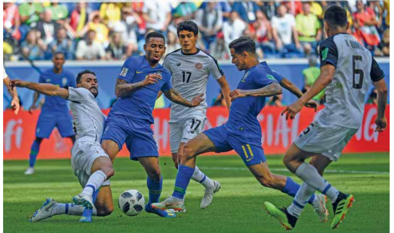
Brazil's forward Philippe Coutinho (2nd-R) shoots to score during the Russia 2018 World Cup Group E football match between Brazil and Costa Rica at the Saint Petersburg Stadium in Saint Petersburg

practically the last kick of the match, volleying home following a quick counter-attack as Costa Rica pushed for an equaliser.