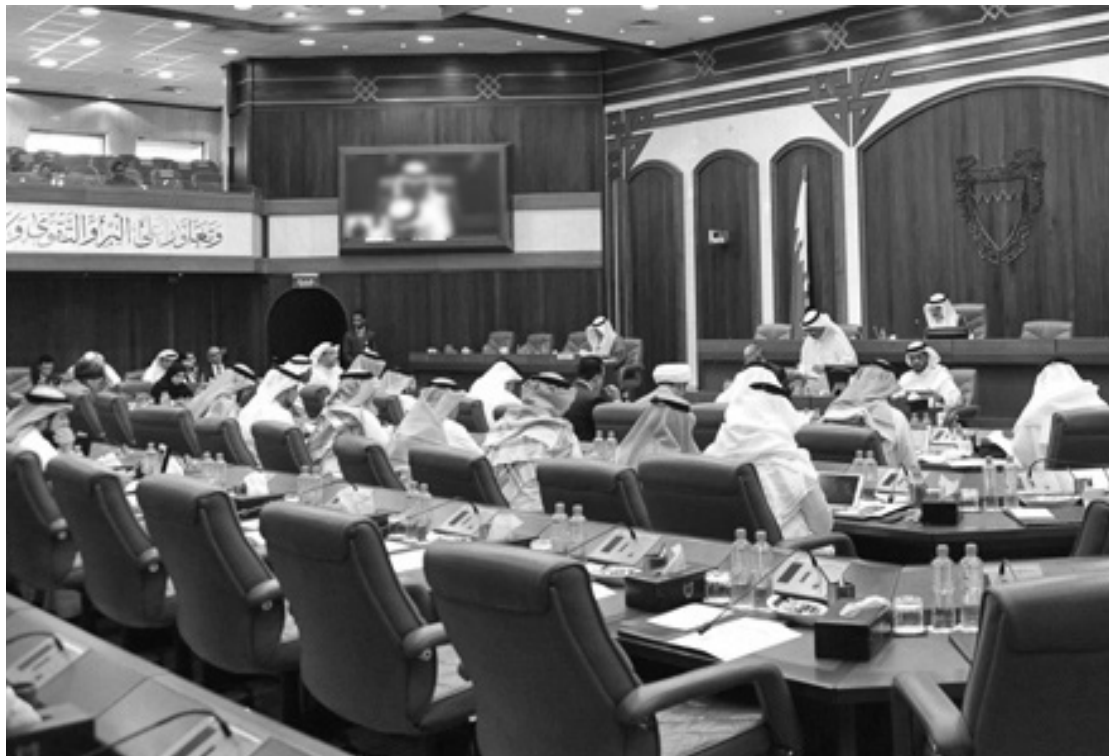
House of Representatives had unanimously rejected the bill.

His Majesty earlier this week directed the government to reconsider the two bills of pension